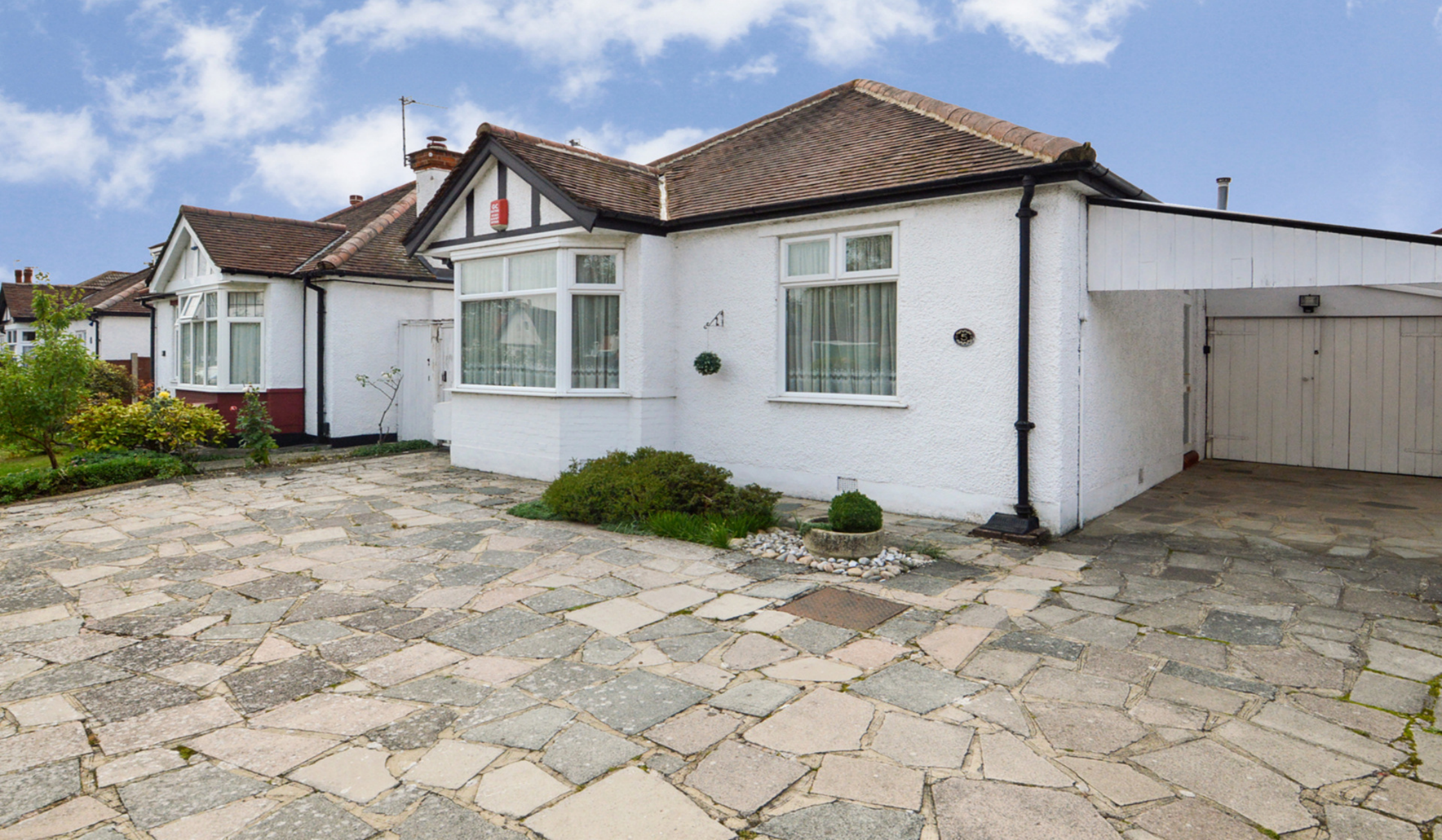
ASH GROVE EN1 2 bedroom detached house