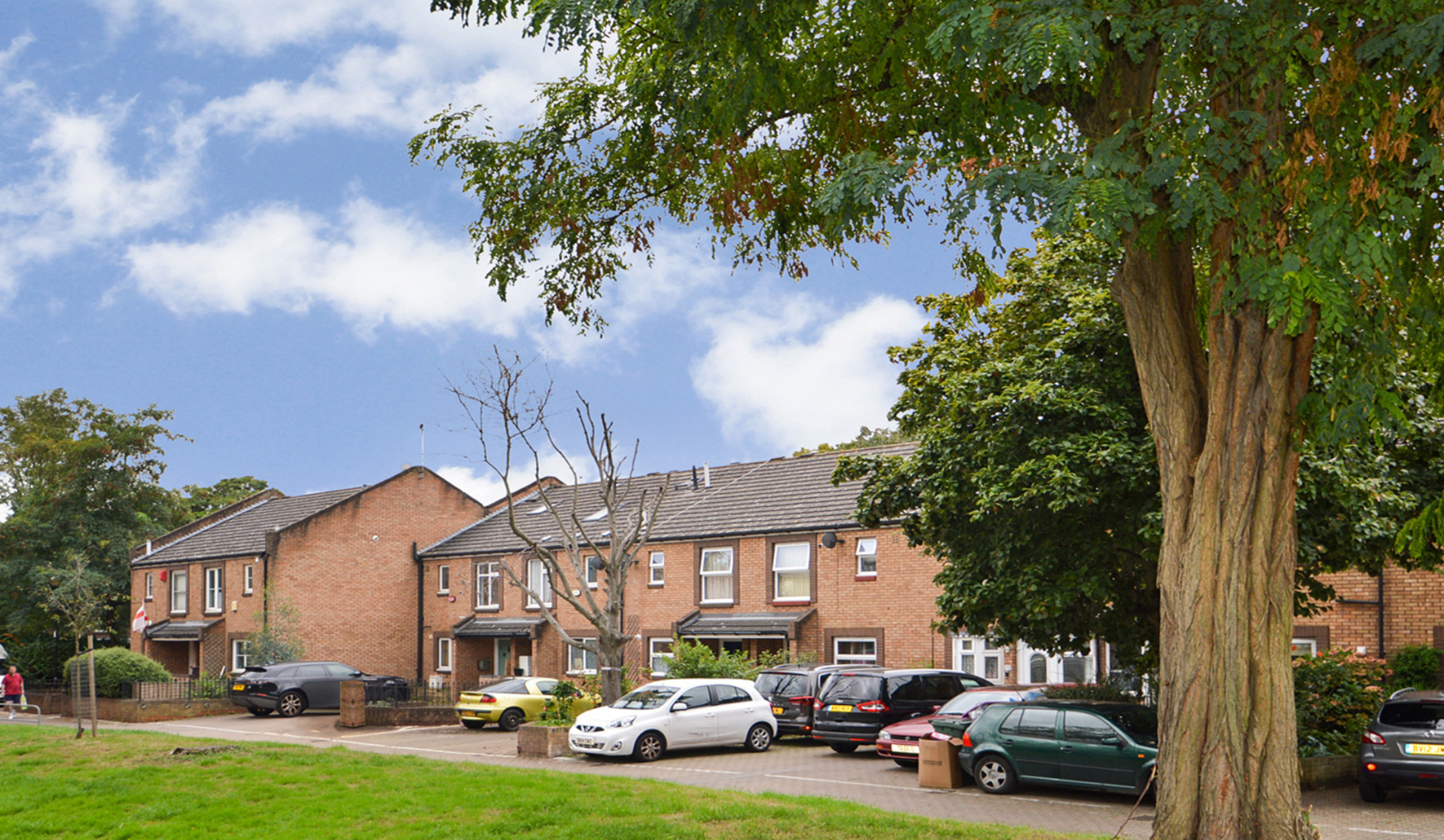
RECTORY SQUARE E1 4 bedroom terraced house