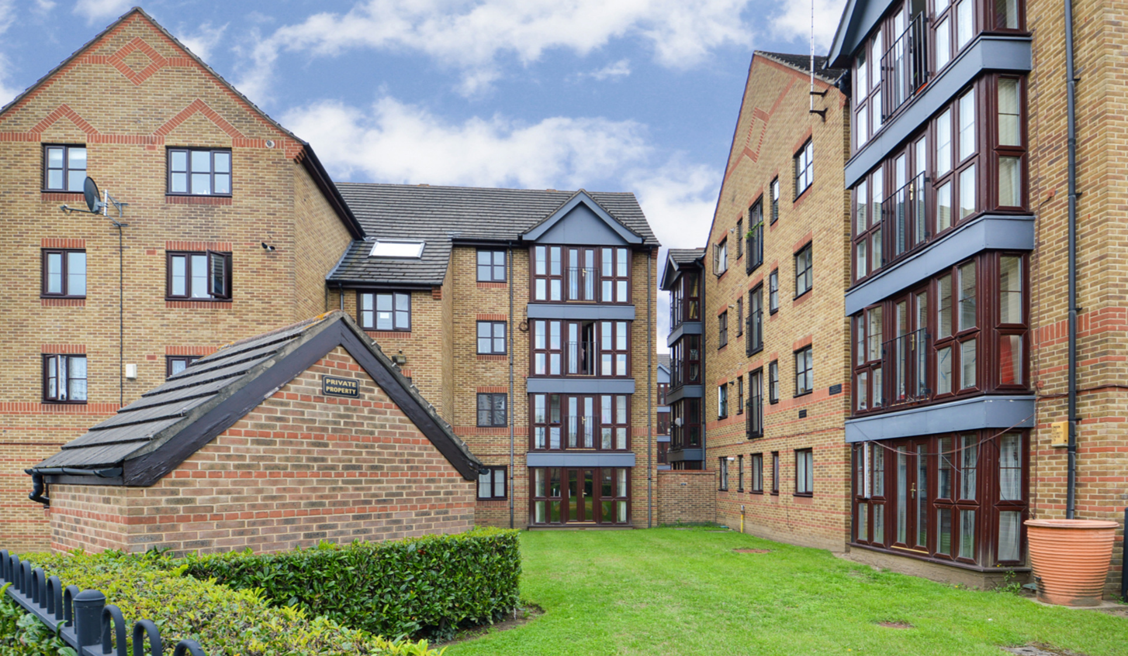
LAGONDA HOUSE E3 2 bedroom apartment