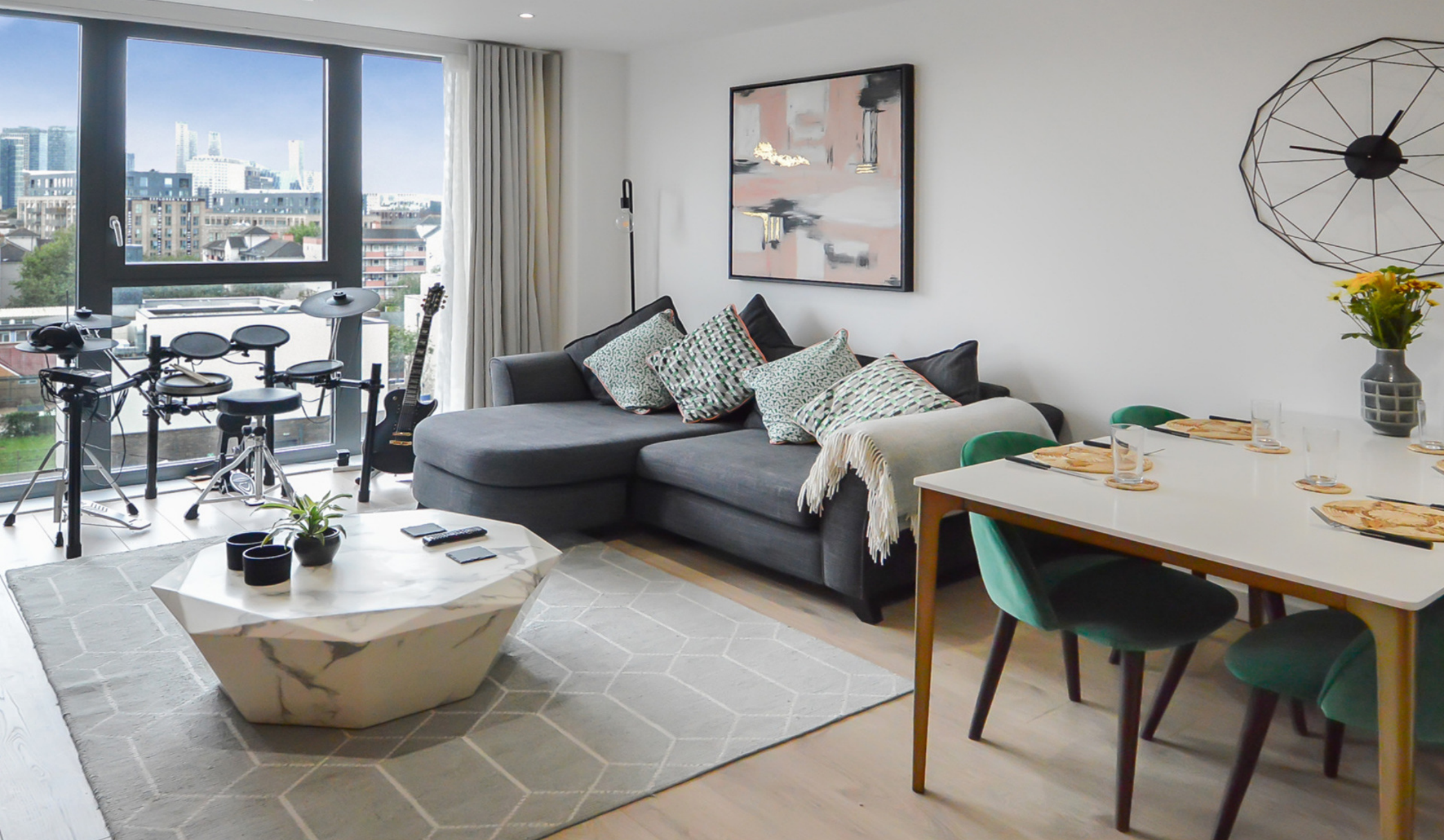
DUESBURY HOUSE E3 1 bedroom apartment