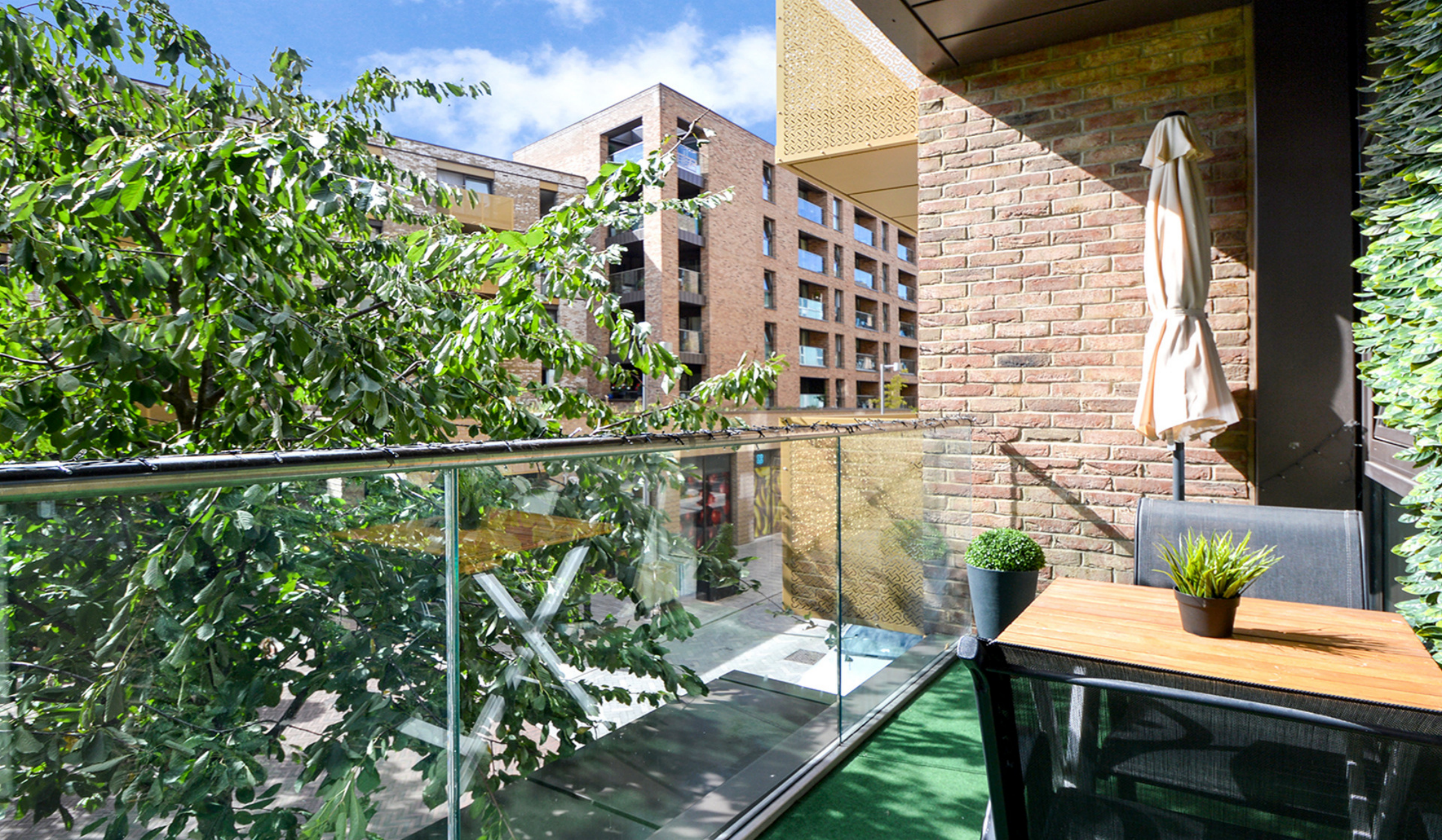
COPENHAGEN COURT SE8 studio apartment