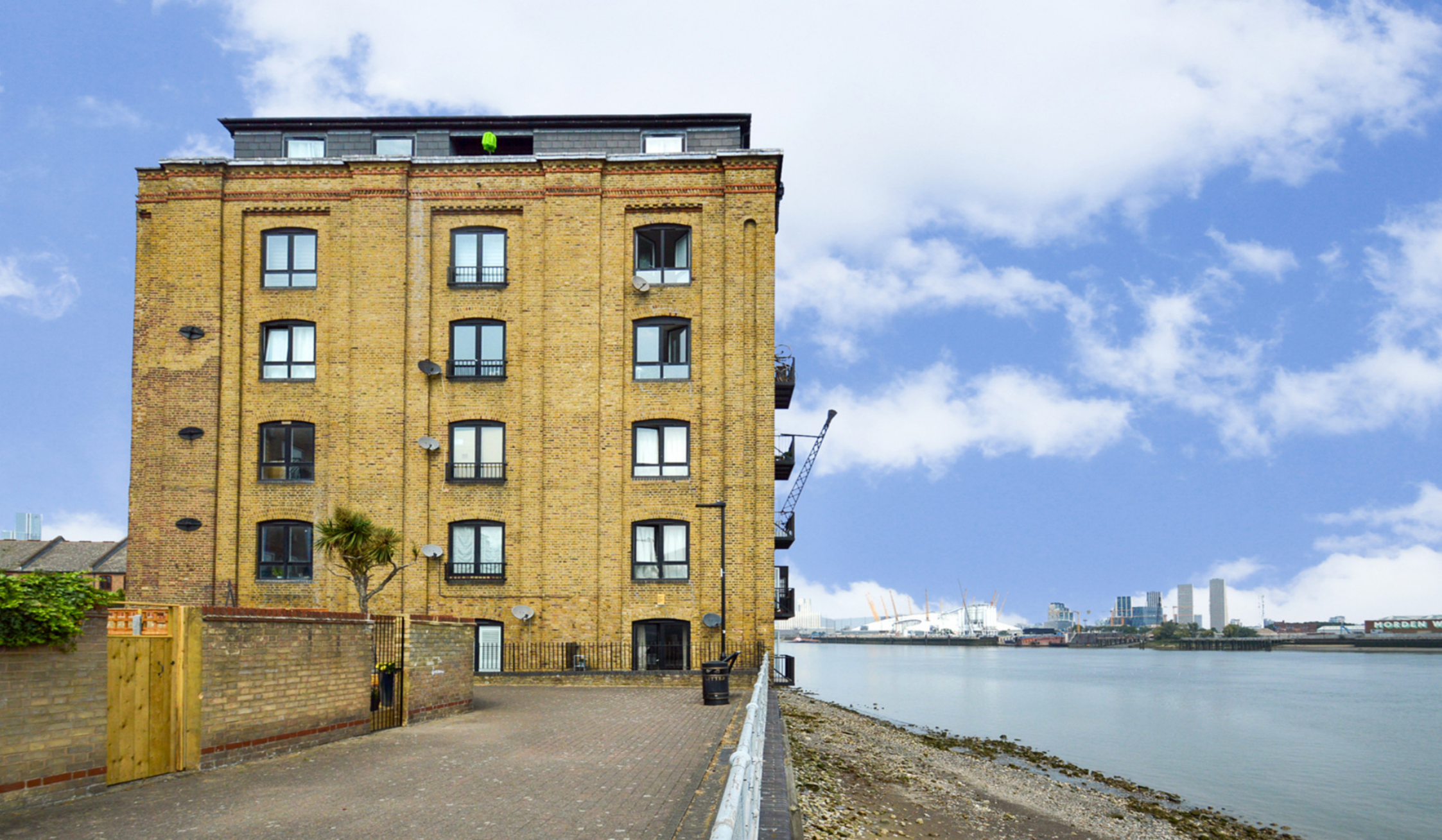
CUBITT WHARF E14 2 bedroom apartment