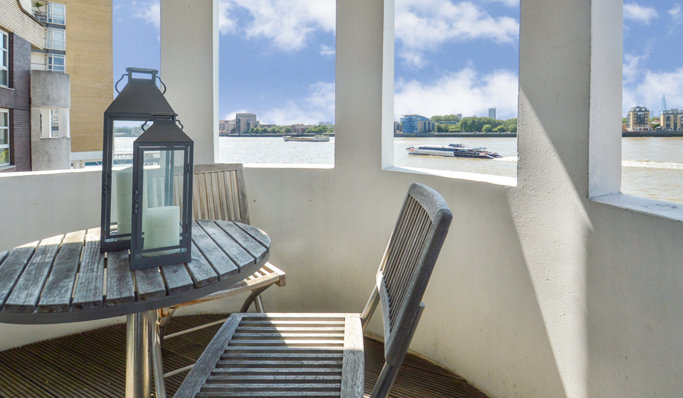
CASCADES TOWER E14 2 bedroom apartment