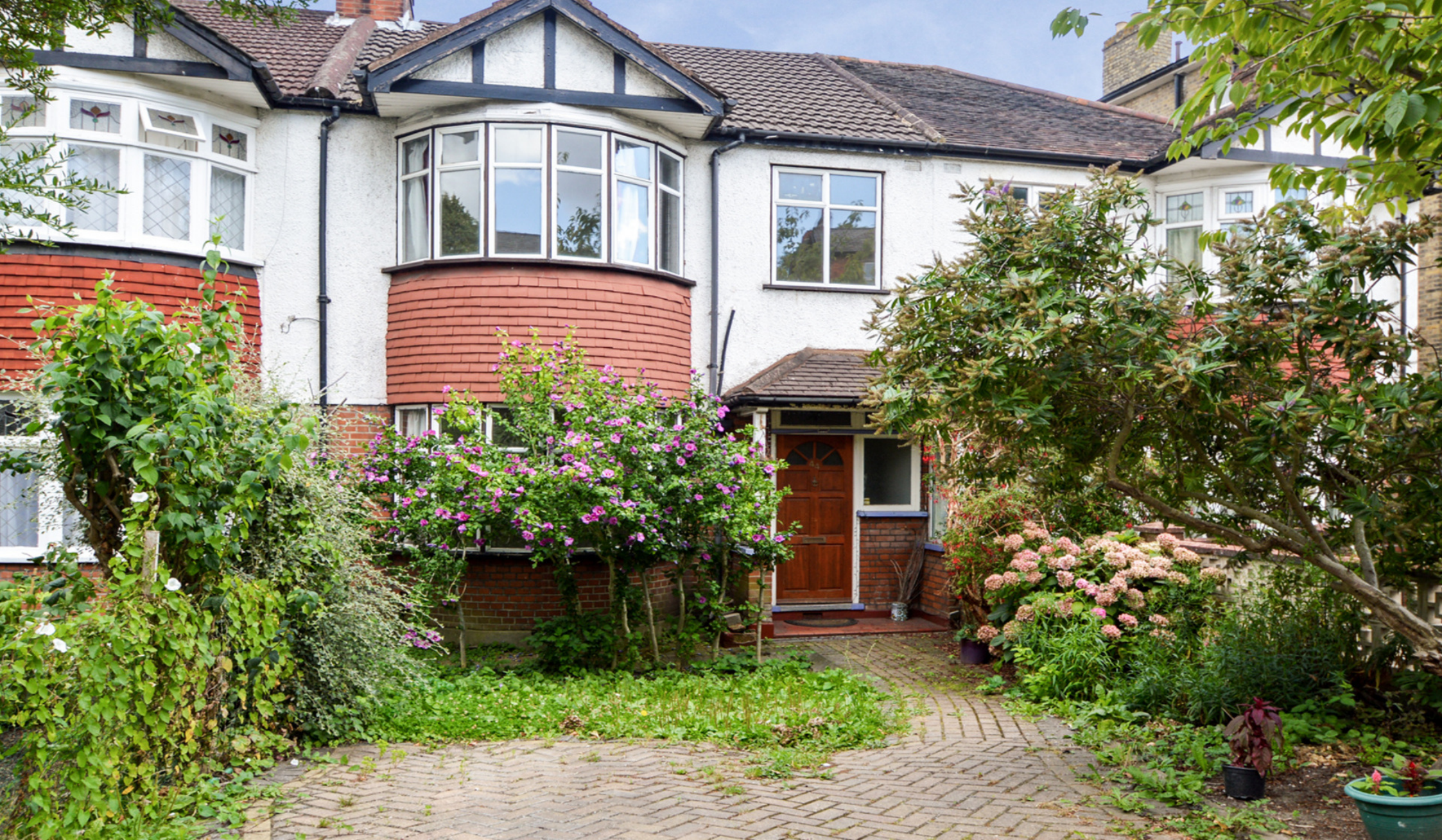
ANERLEY PARK SE20 4 bedroom terraced house