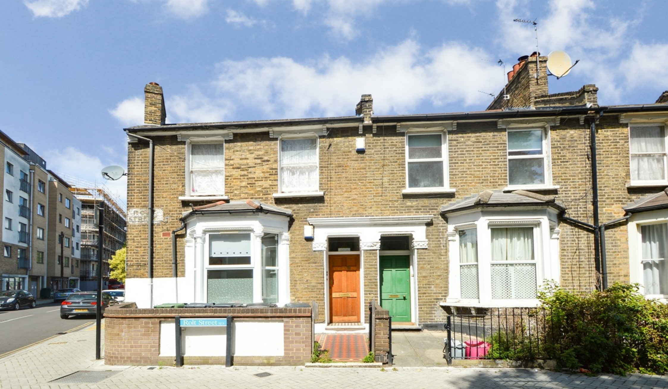
ROLT STREET SE8 2 bedroom apartment