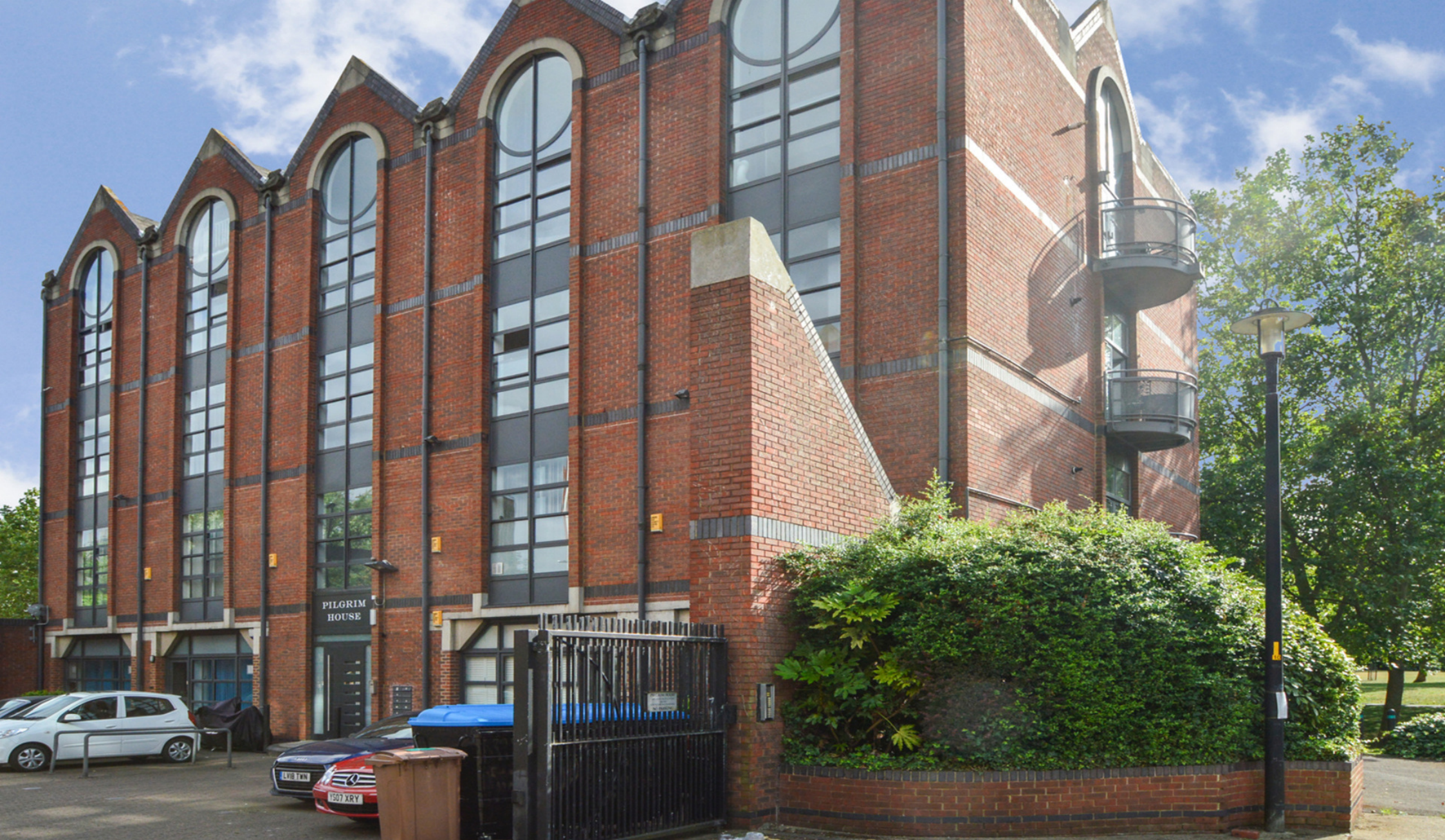
PILGRIM HOUSE SE16 2 bedroom apartment