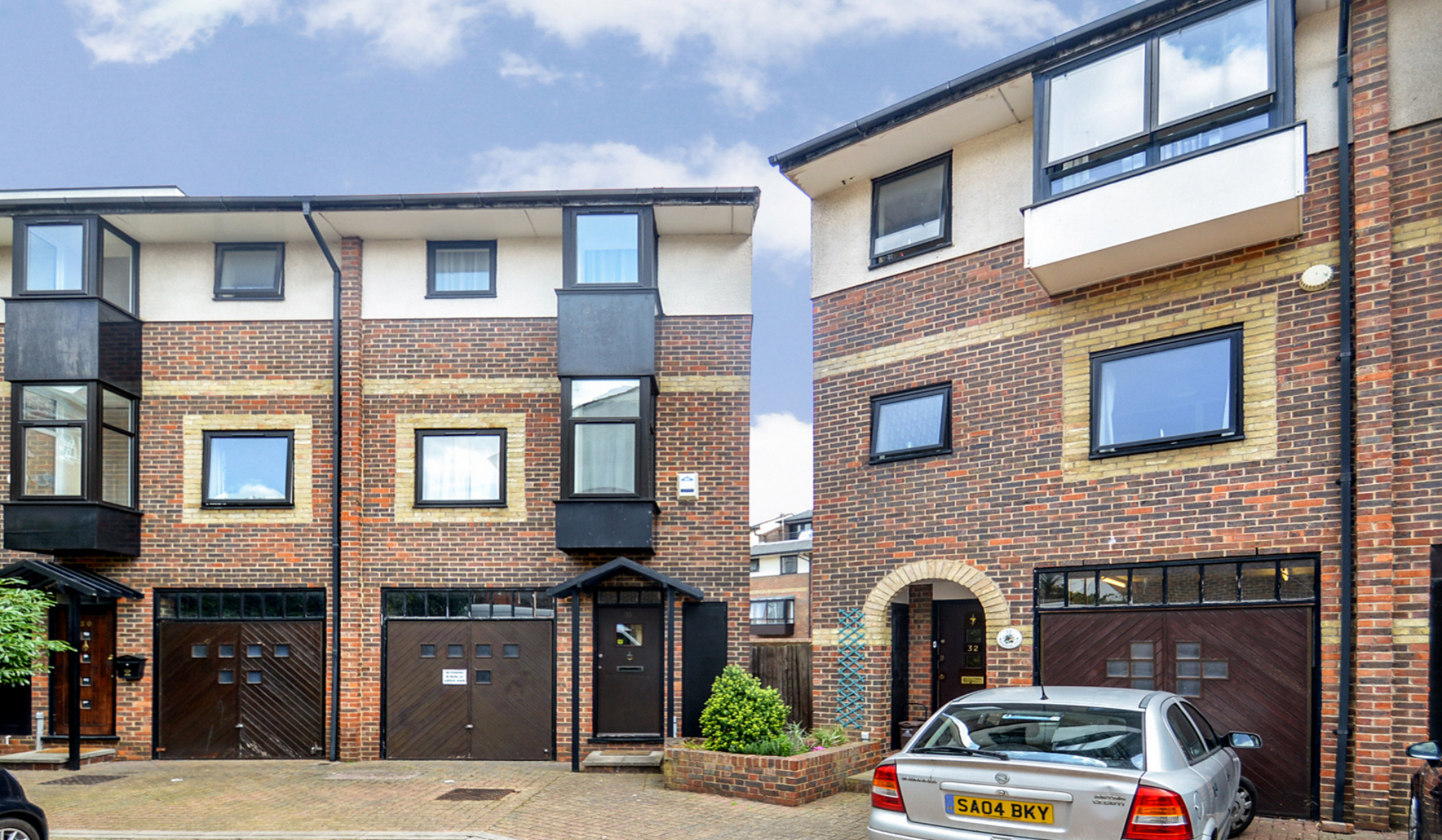
IRONMONGERS PLACE E14 2 bedroom town house