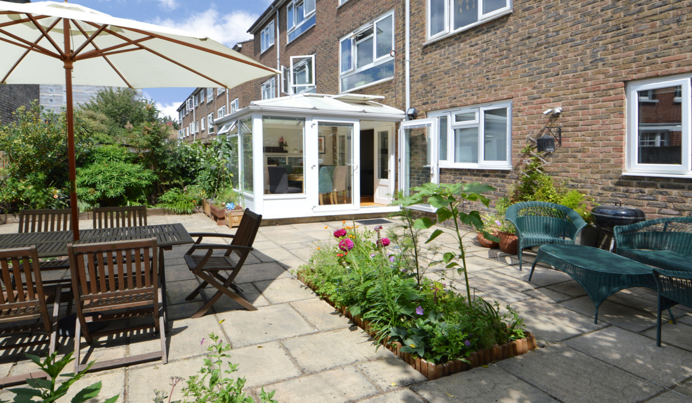
BRIERLY GARDENS E2 3 bedroom apartment