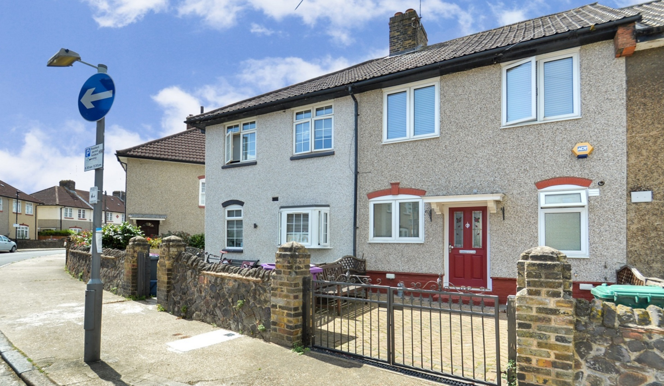
HESPERUS CRESCENT E14 3 bedroom terraced house