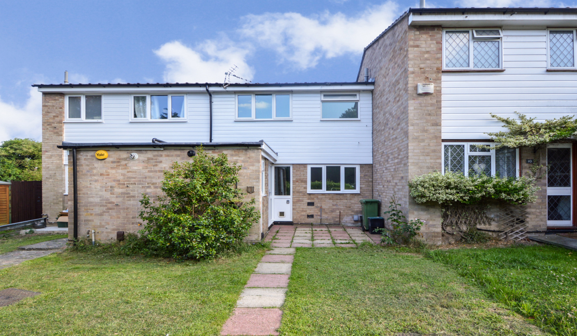
AYLESHAM ROAD BR6 3 bedroom terraced house