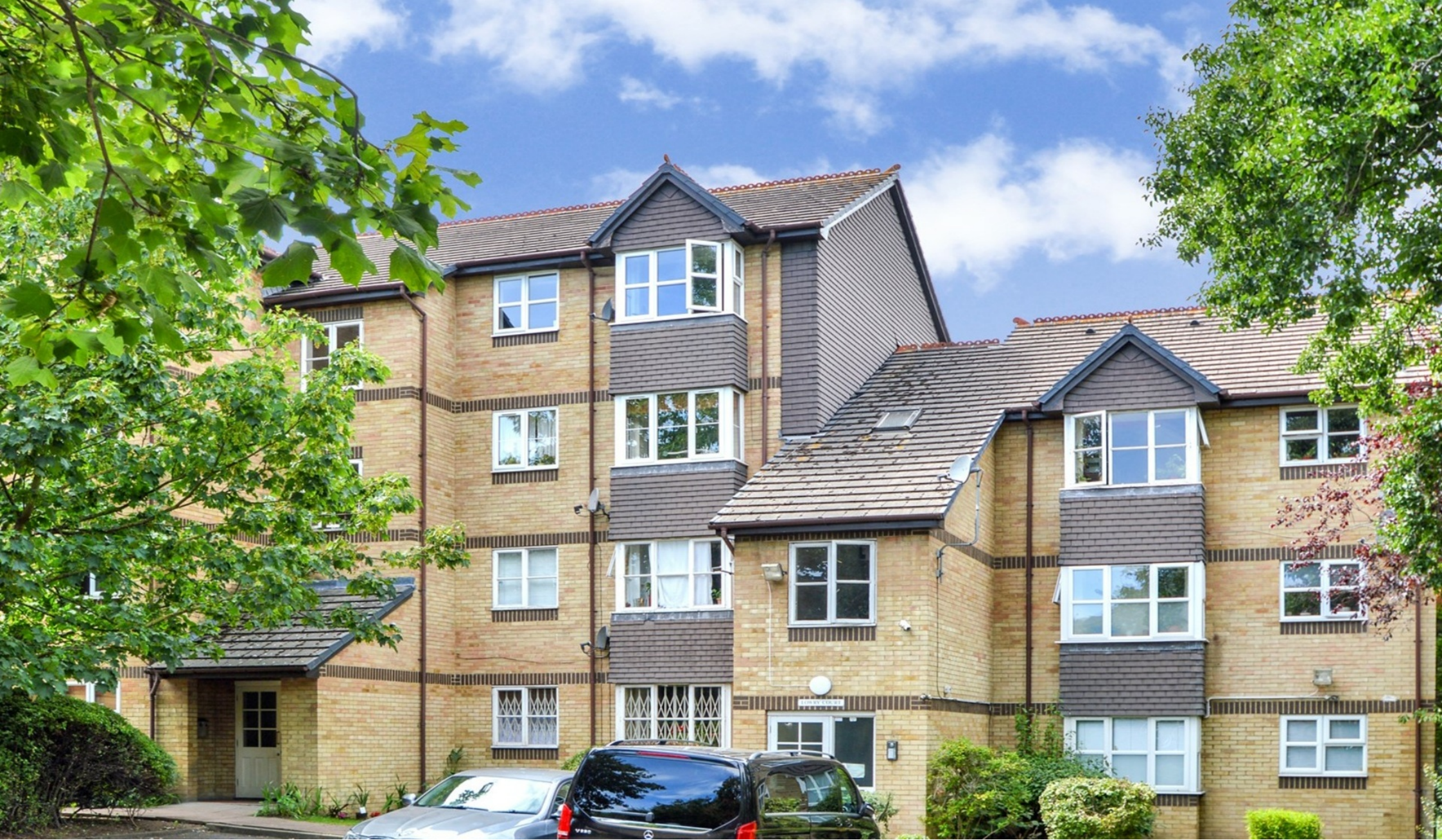
LOWRY COURT SE16 2 bedroom apartment