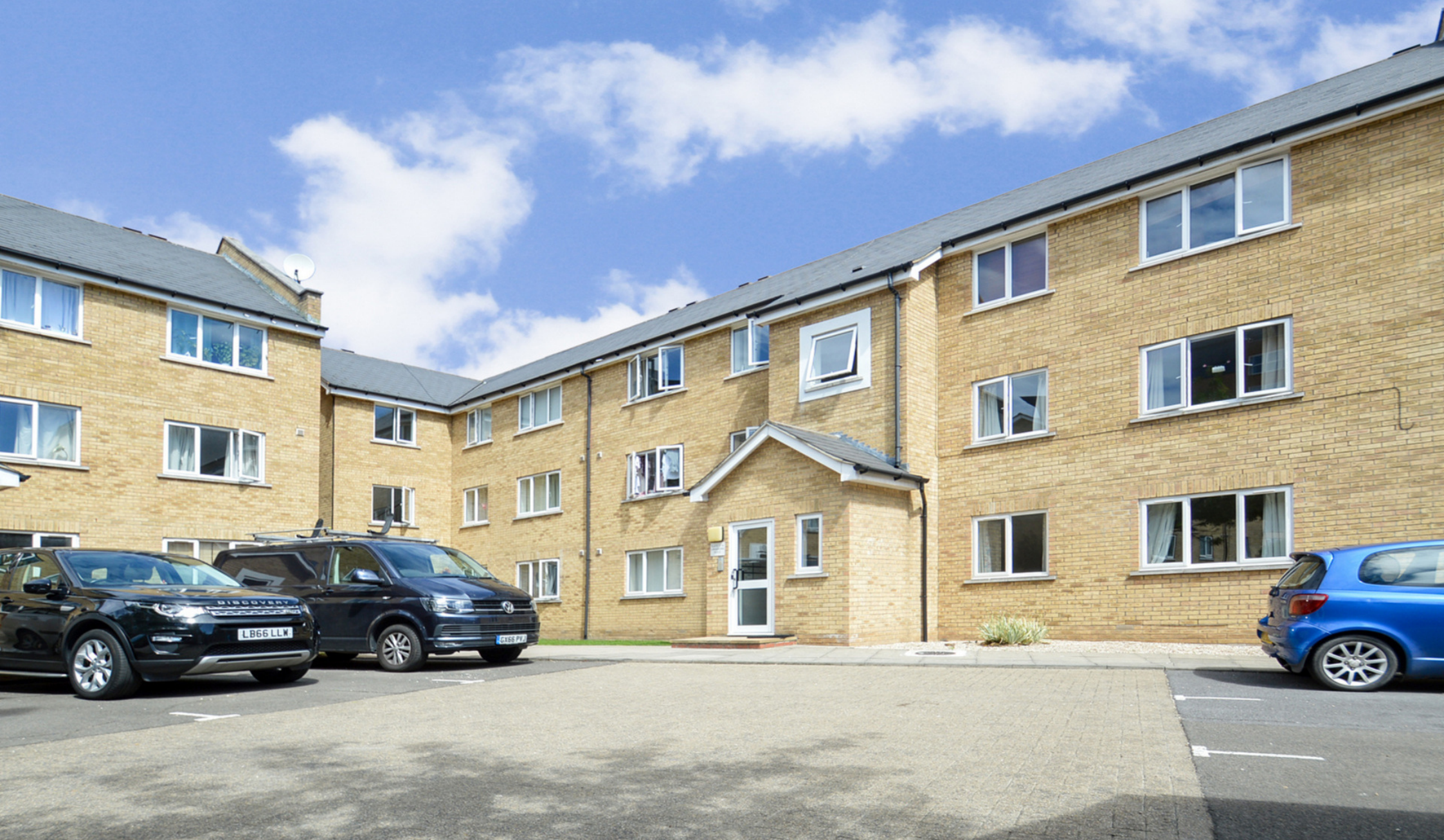
LANGBOURNE PLACE E14 2 bedroom apartment