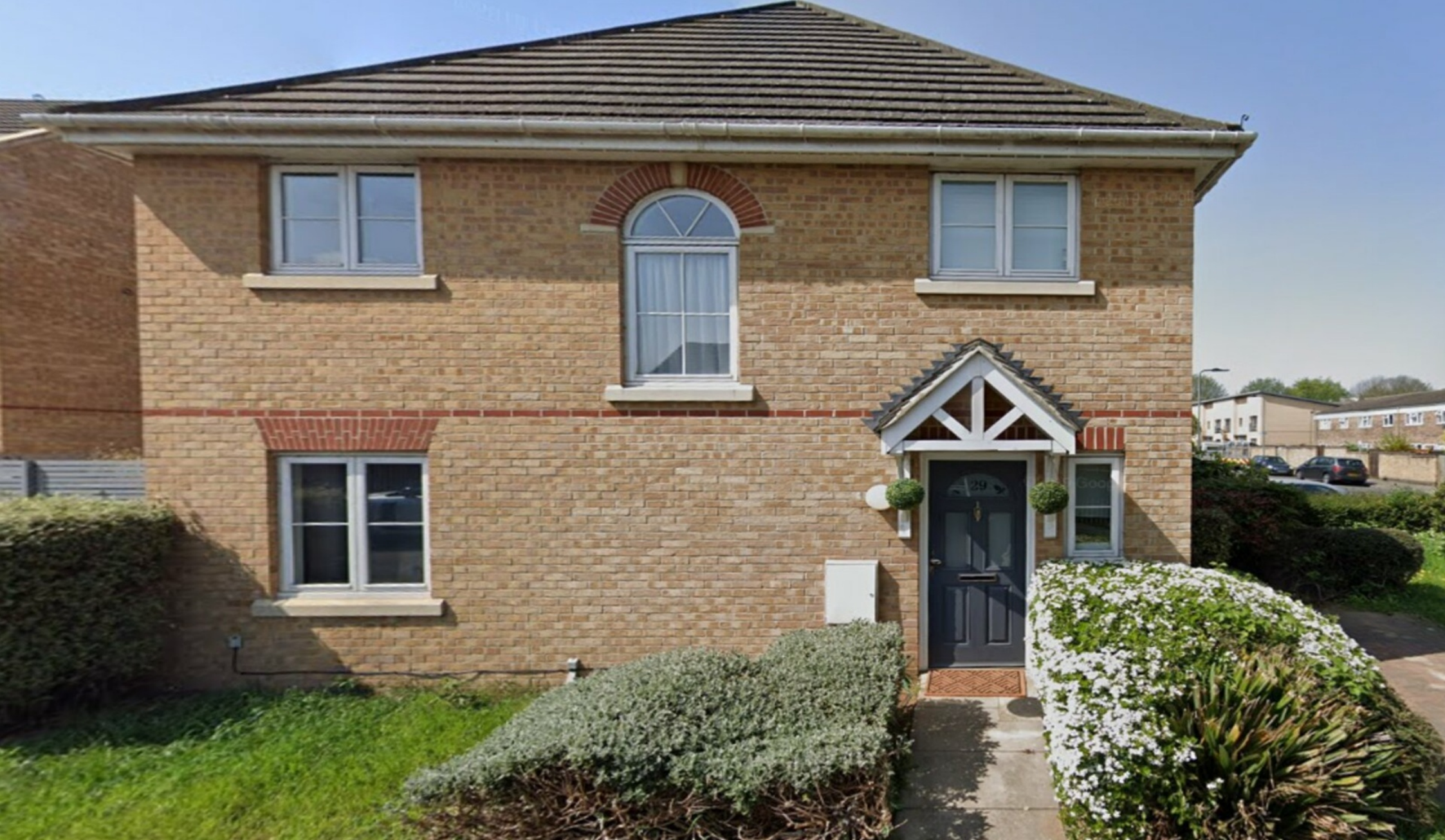
CHESTNUT GROVE SE20 3 bedroom semi-detached house