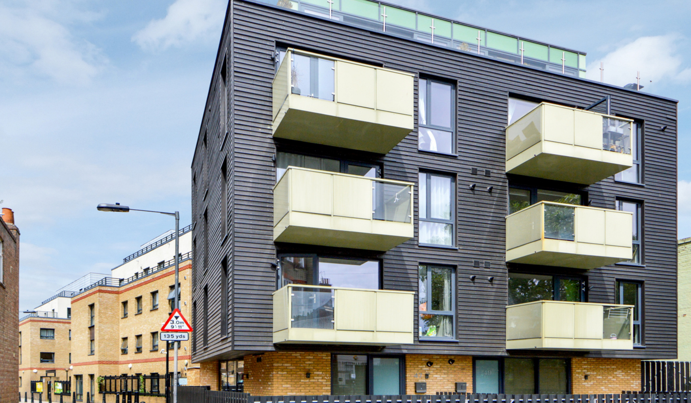
MARIANA COURT E1 2 bedroom apartment