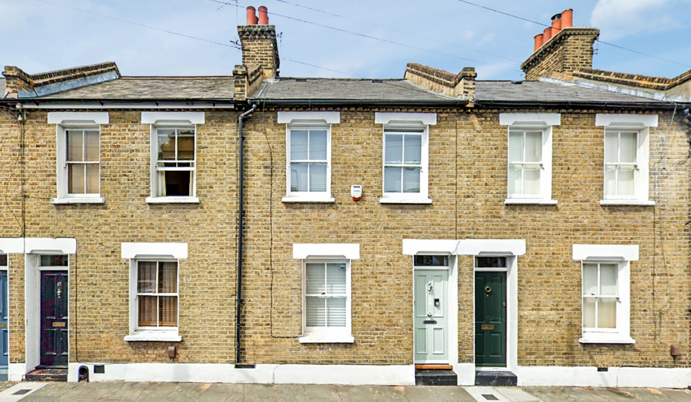
HADRIAN STREET SE10 1 bedroom terraced house