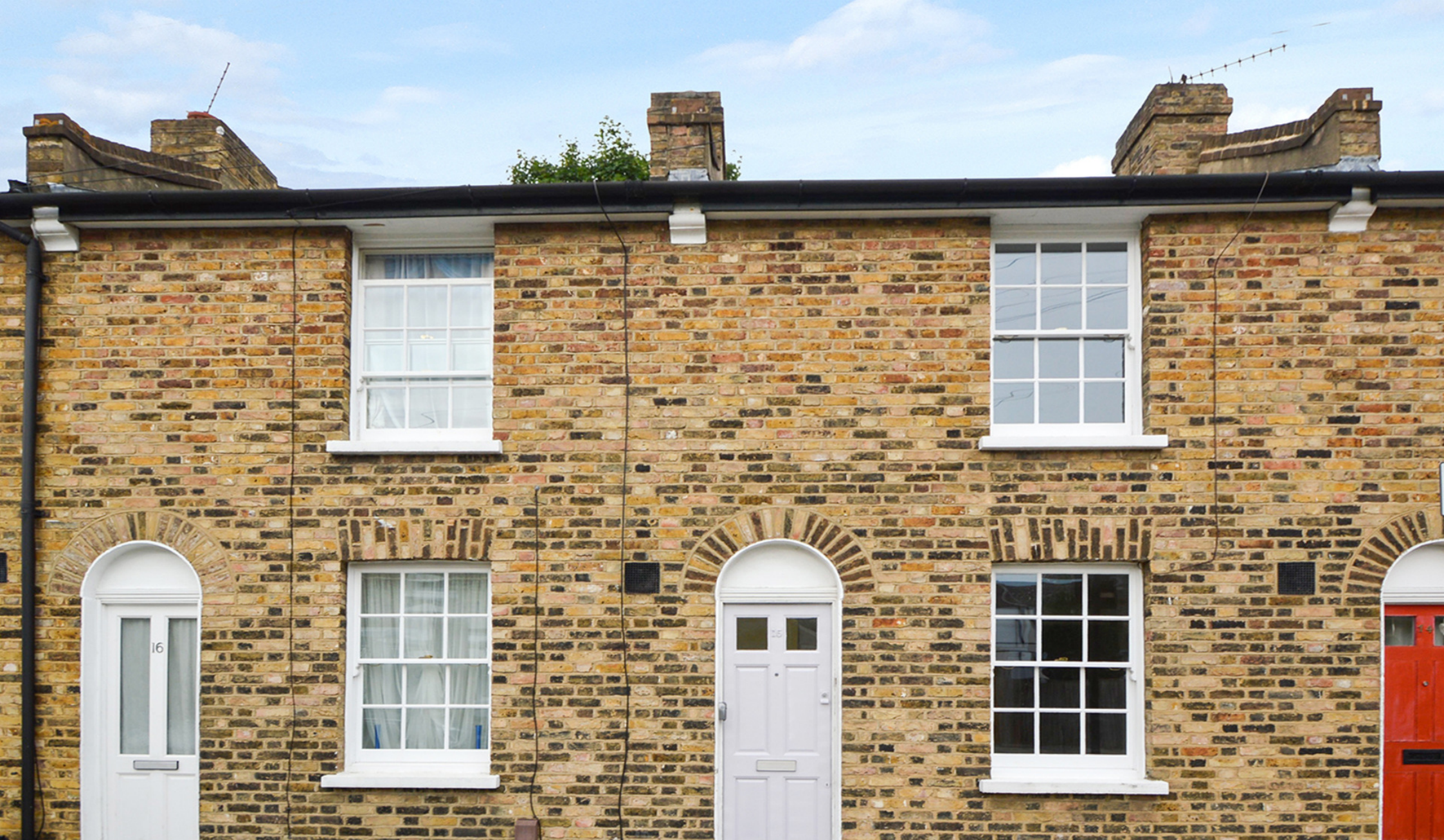
HADRIAN STREET SE10 2 bedroom terraced house