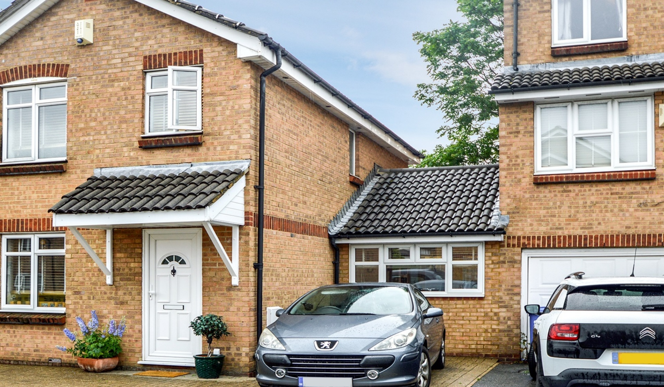
BUSHWOOD DRIVE SE1 4 bedroom detached house