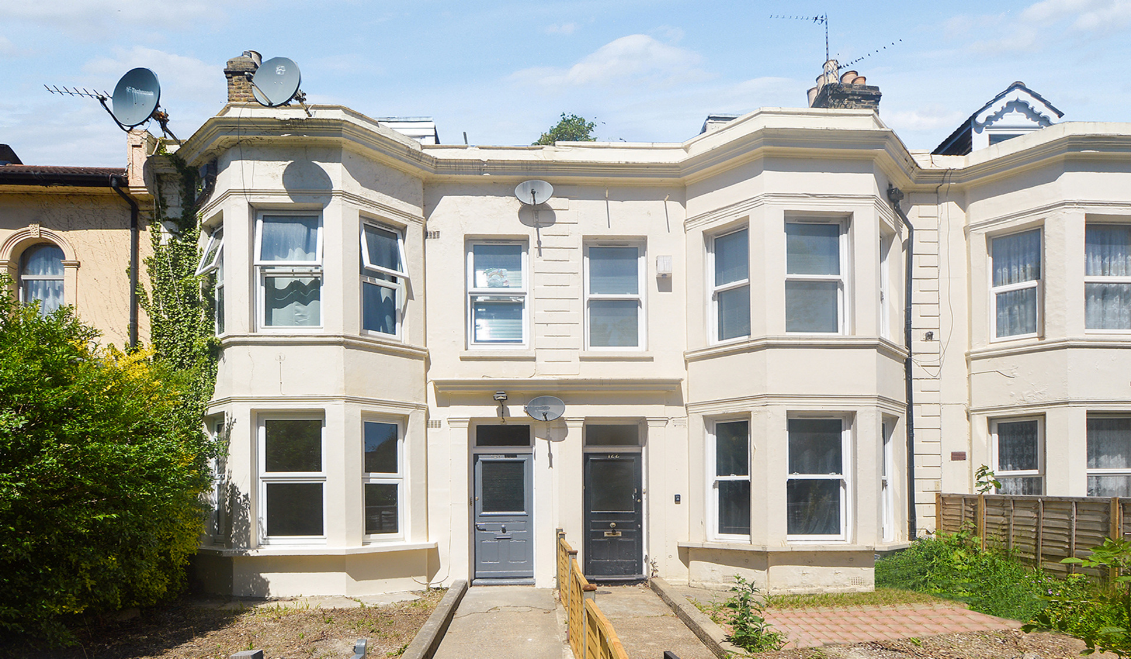
HERBERT ROAD SE18 2 bedroom apartment