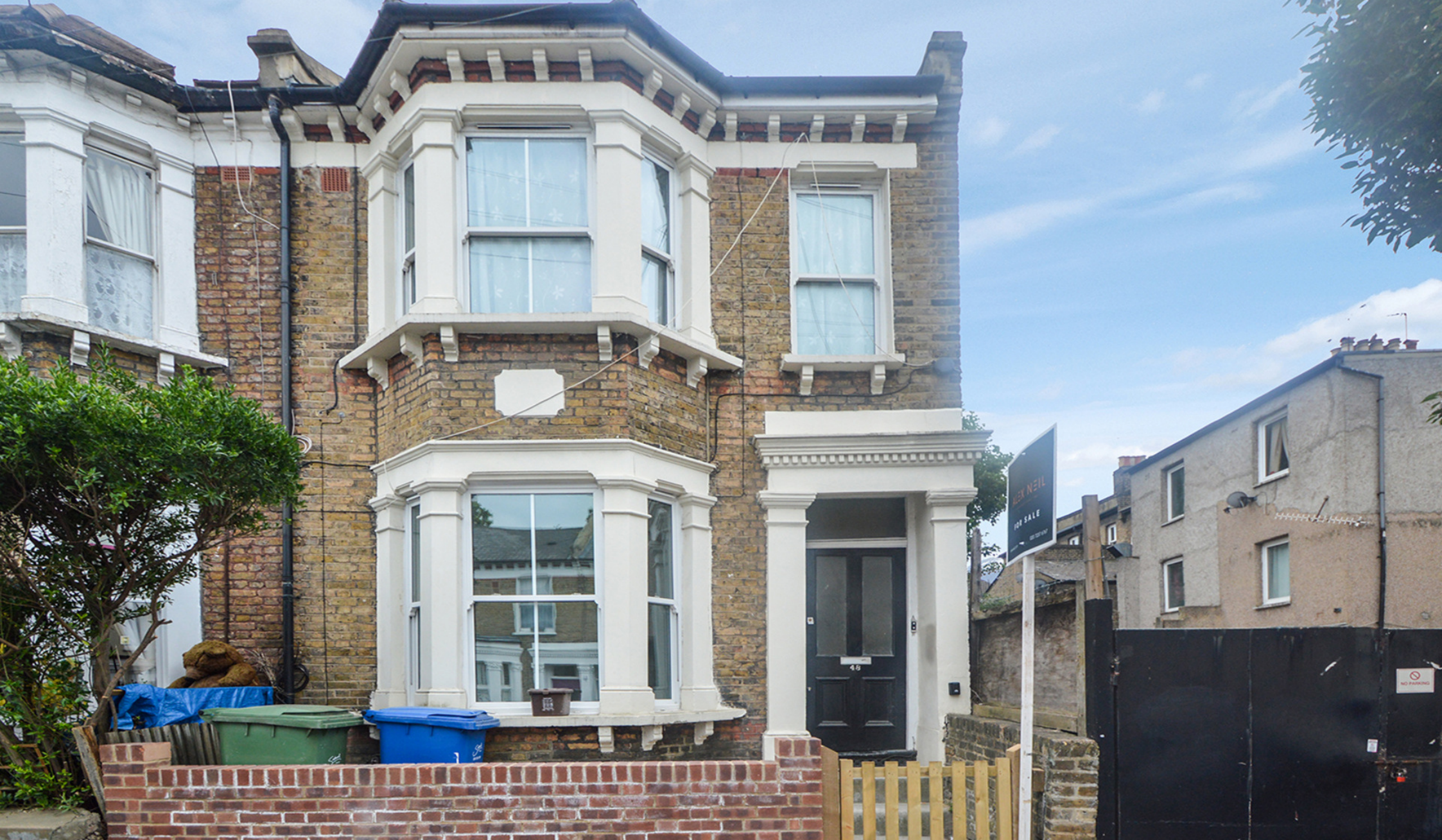
LINNELL ROAD SE5 1 bedroom apartment