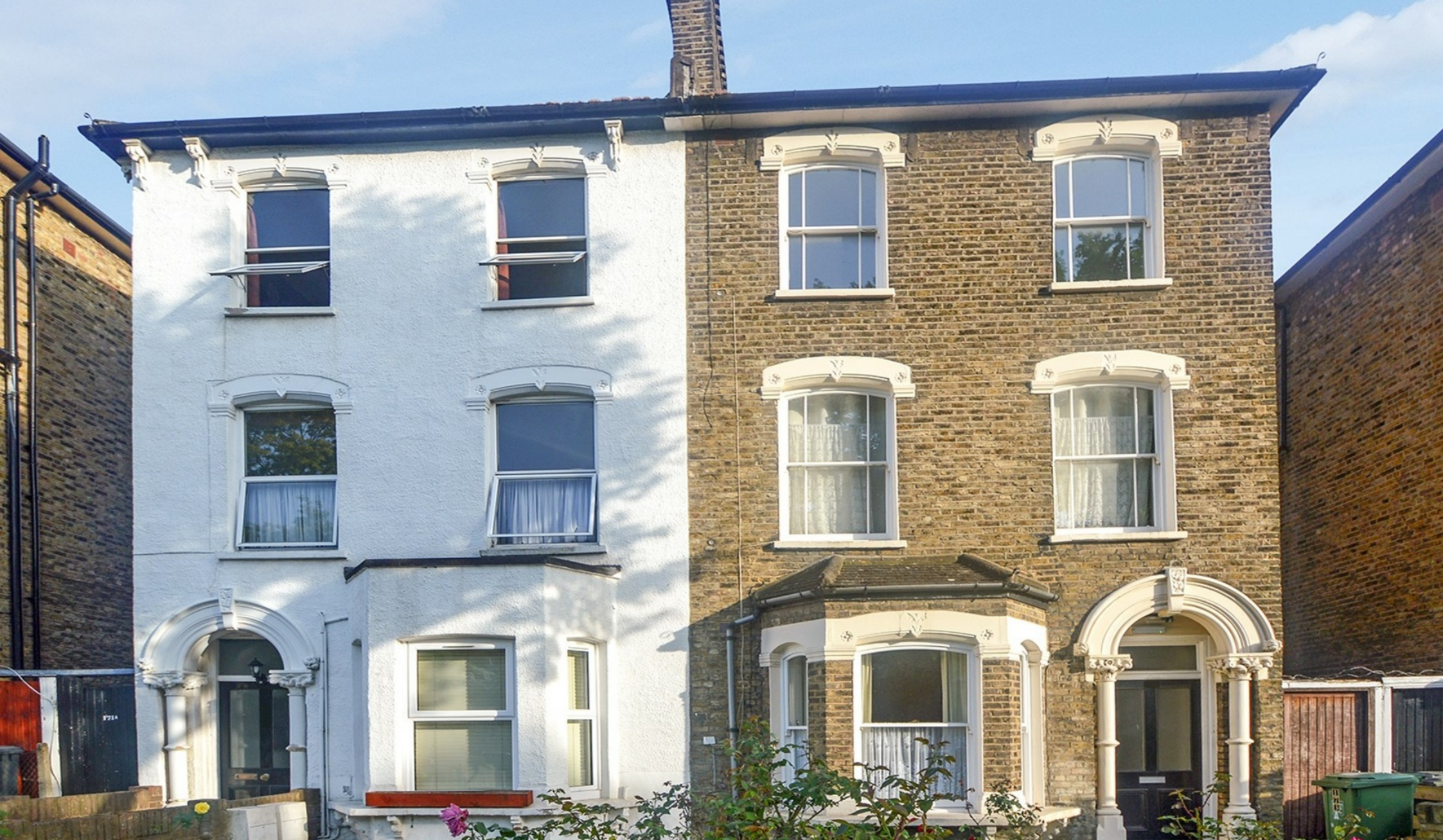
BREAKSPEARS ROAD SE4 1 bedroom duplex apartment