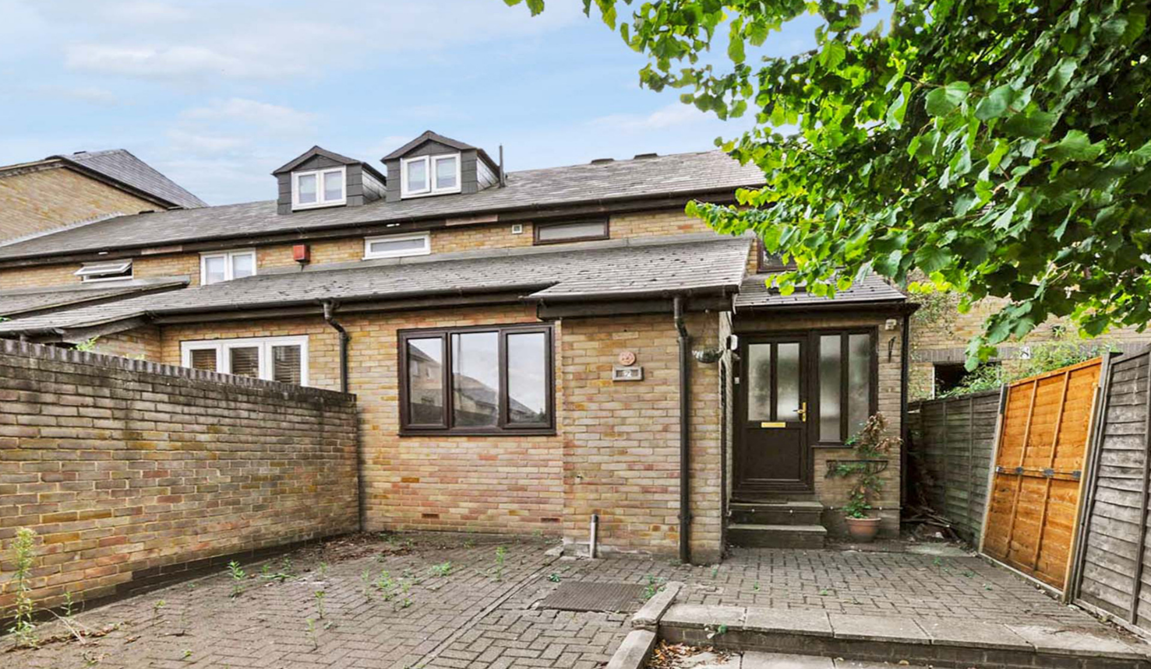
GUNWHALE CLOSE SE16 4 bedroom terraced house