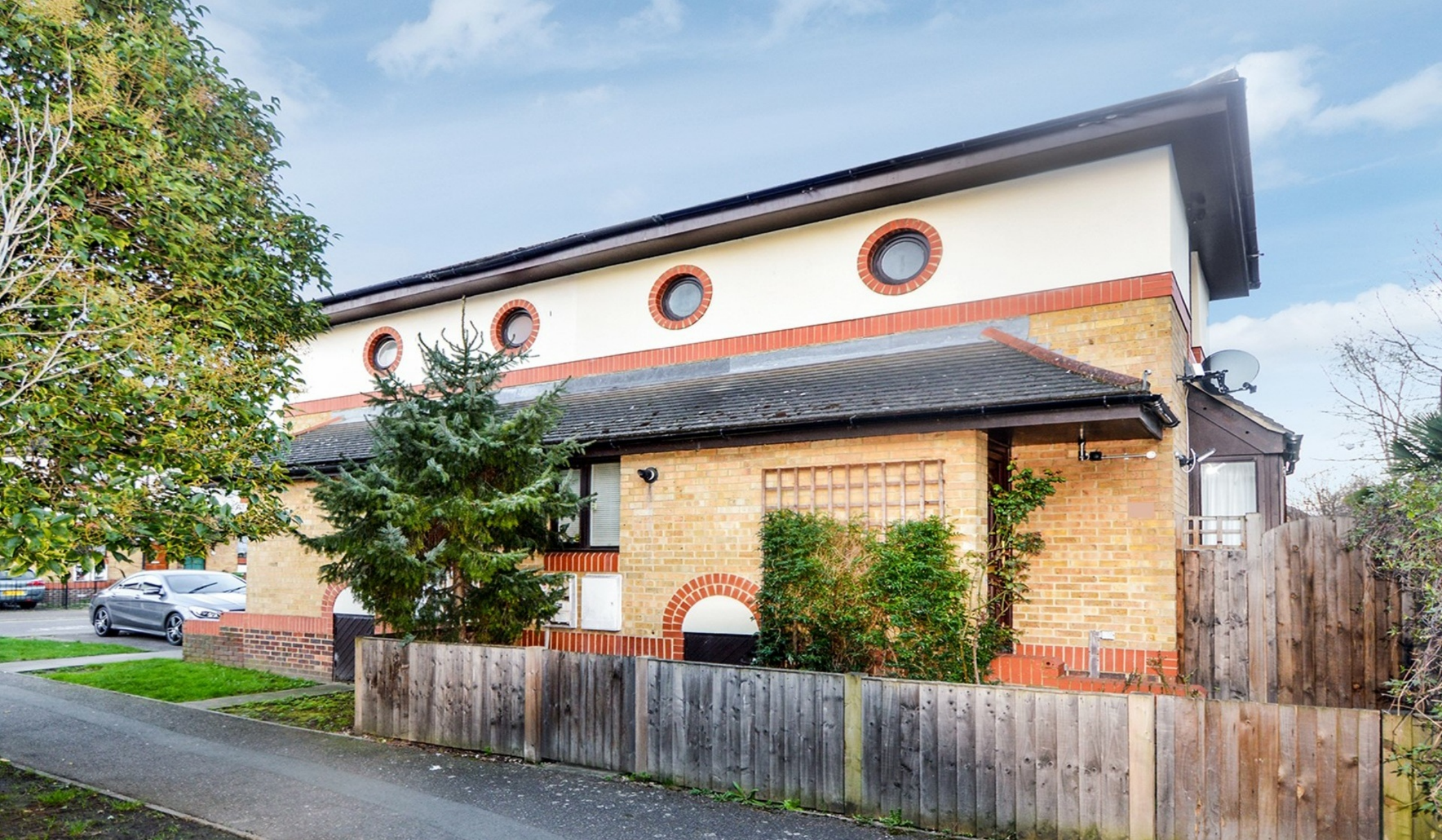
OXLEY CLOSE SE1 1 bedroom end of terrace