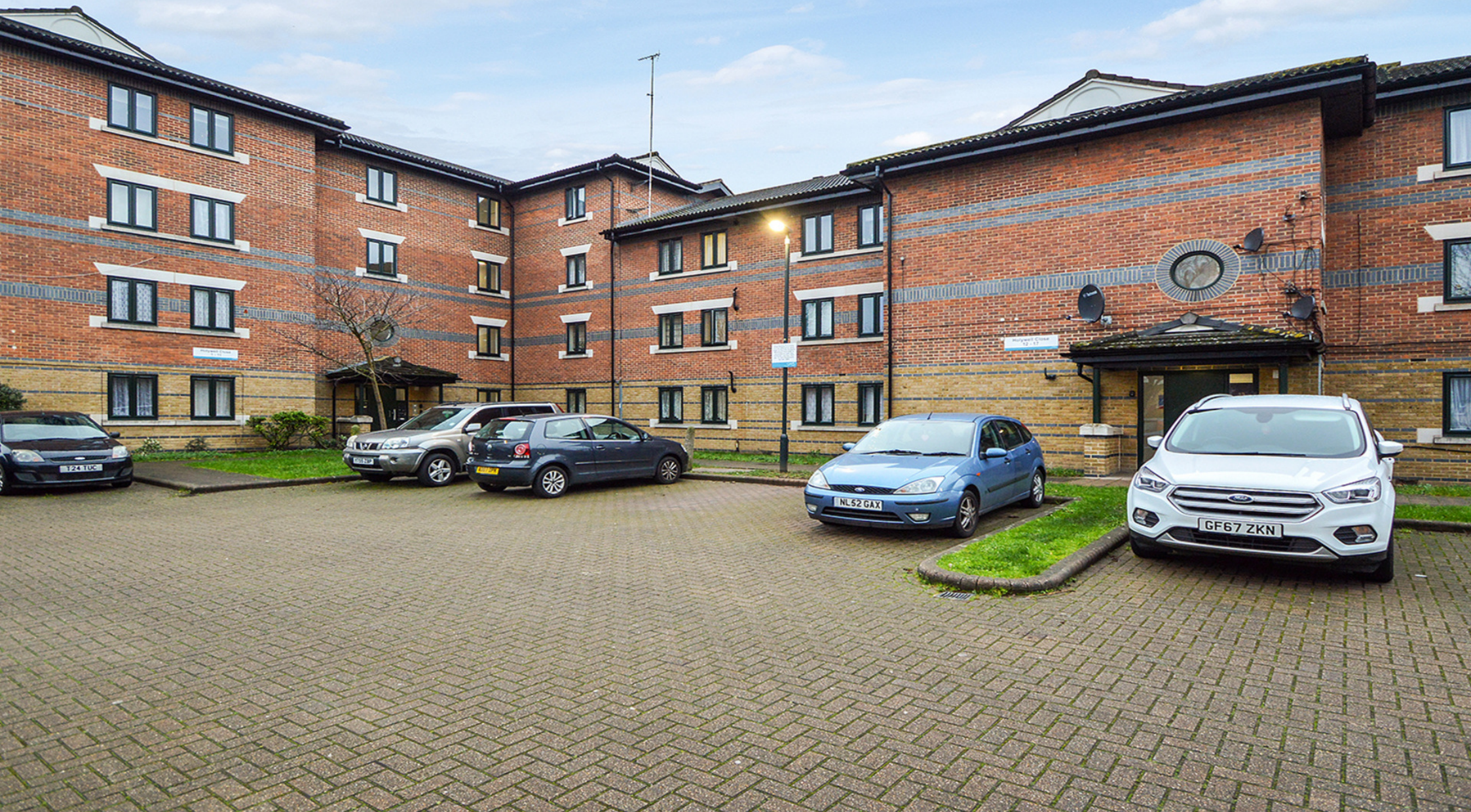
HOLYWELL CLOSE SE16 2 bedroom apartment