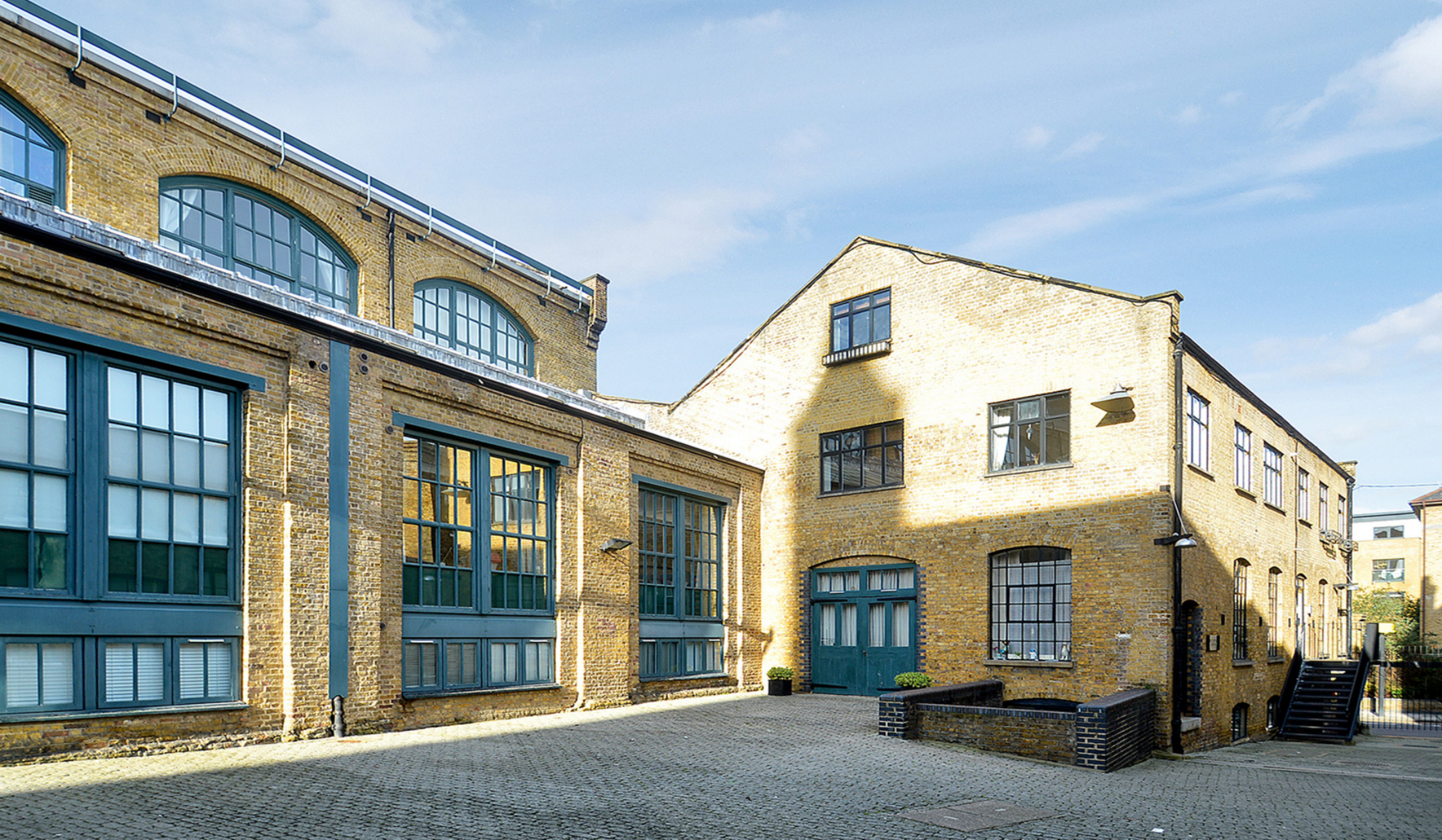
RIVERWAY HOUSE E14 1 bedroom apartment