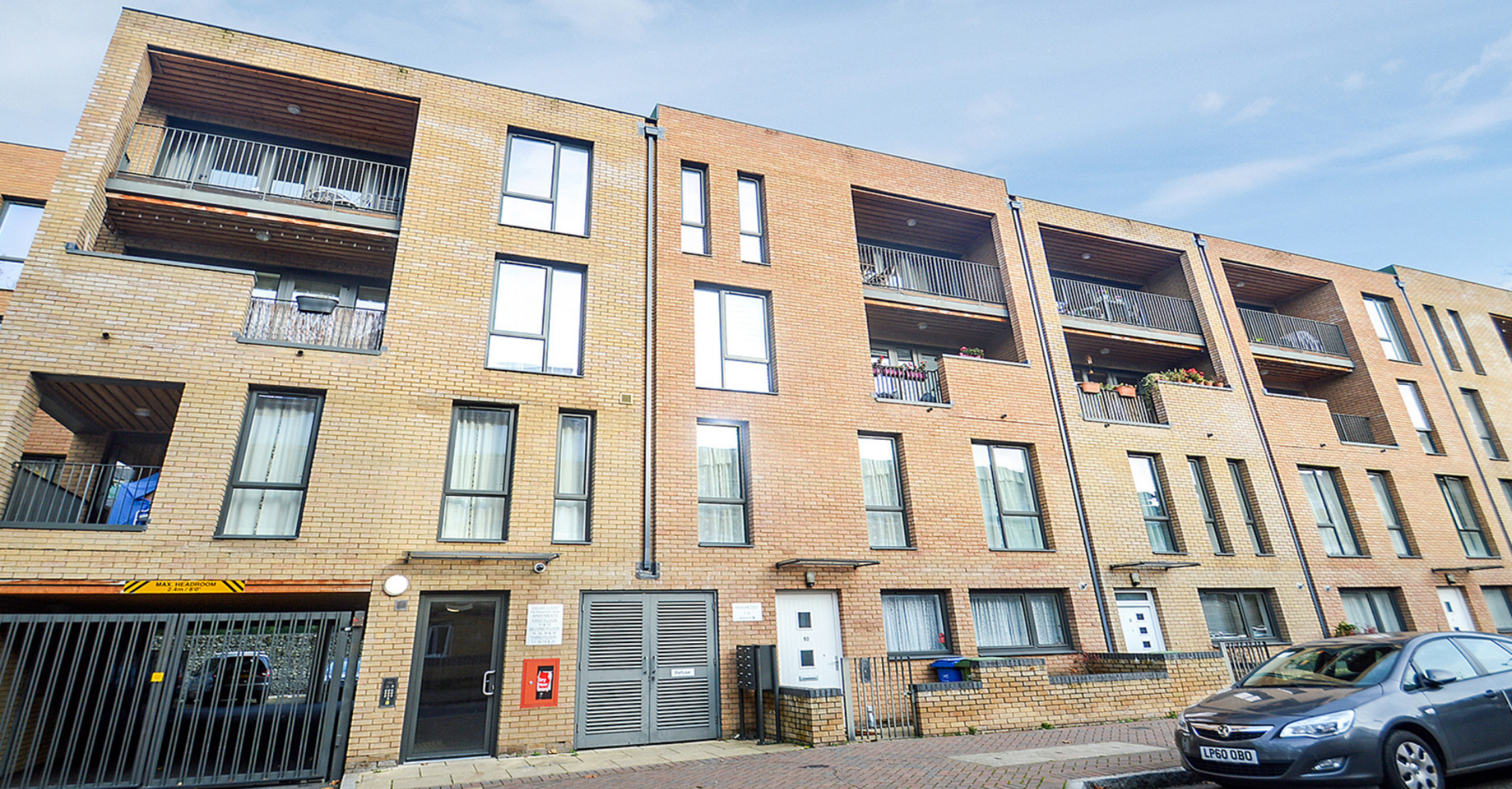
OSCAR COURT SE16 2 bedroom apartment