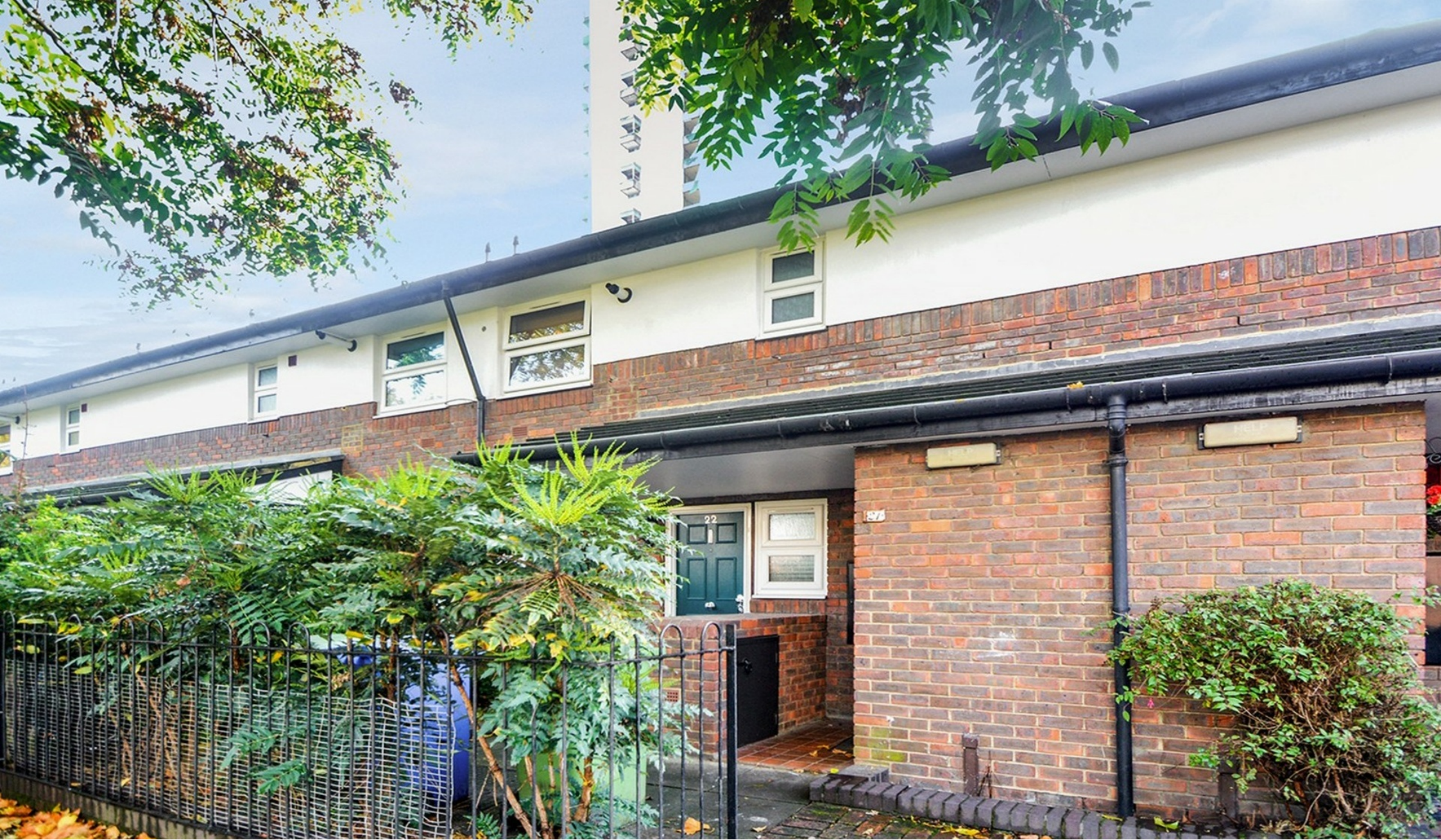
FRANKLAND CLOSE SE16 1 bedroom apartment