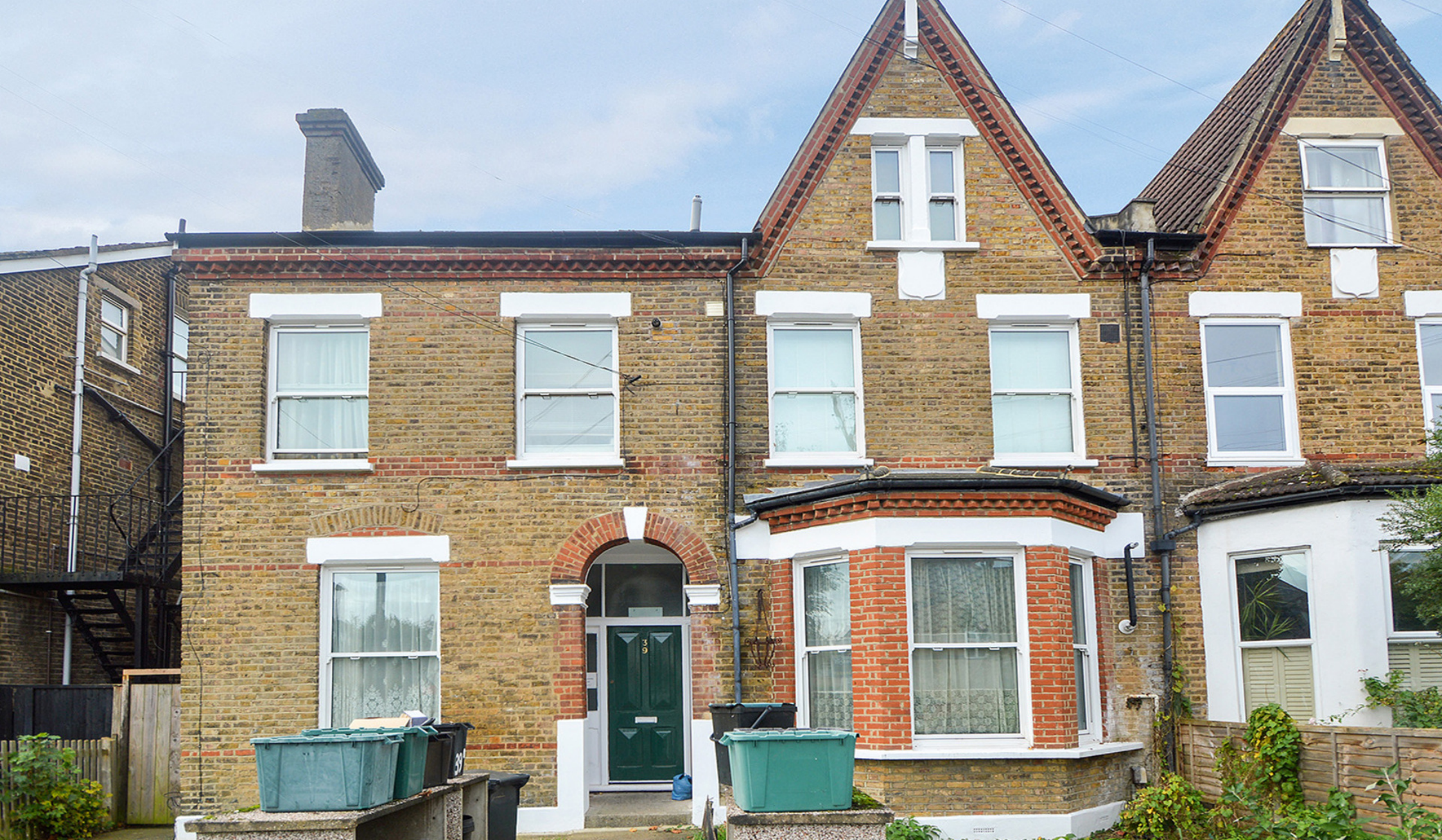
SAMOS ROAD SE20 1 bedroom apartment