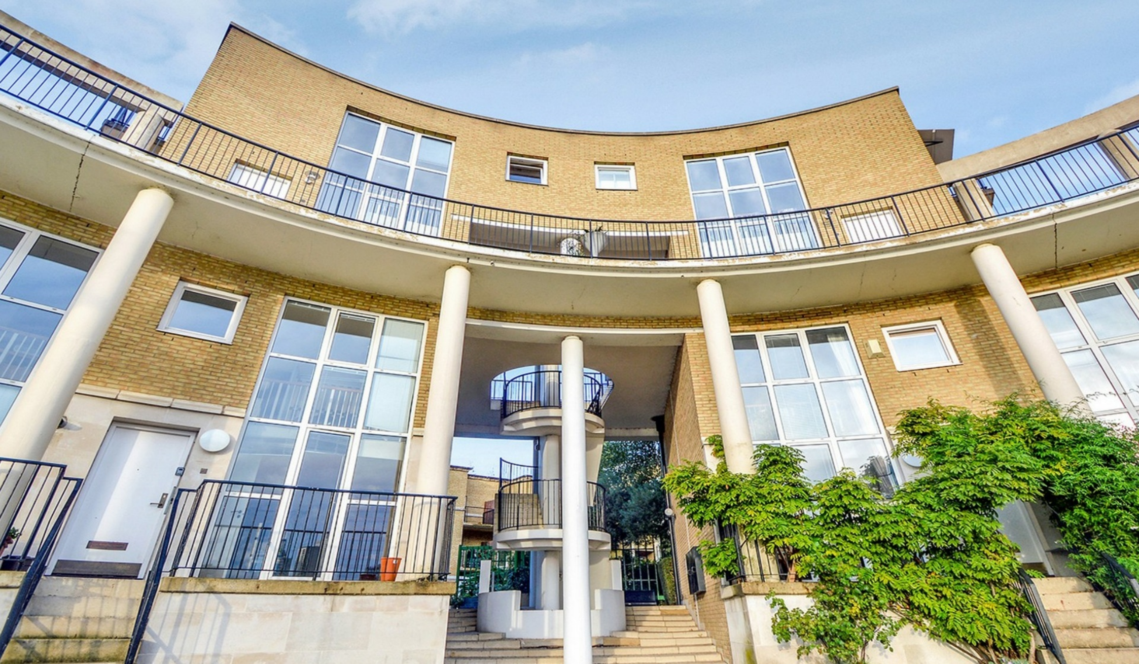
PRINCES COURT SE16 2 bedroom apartment