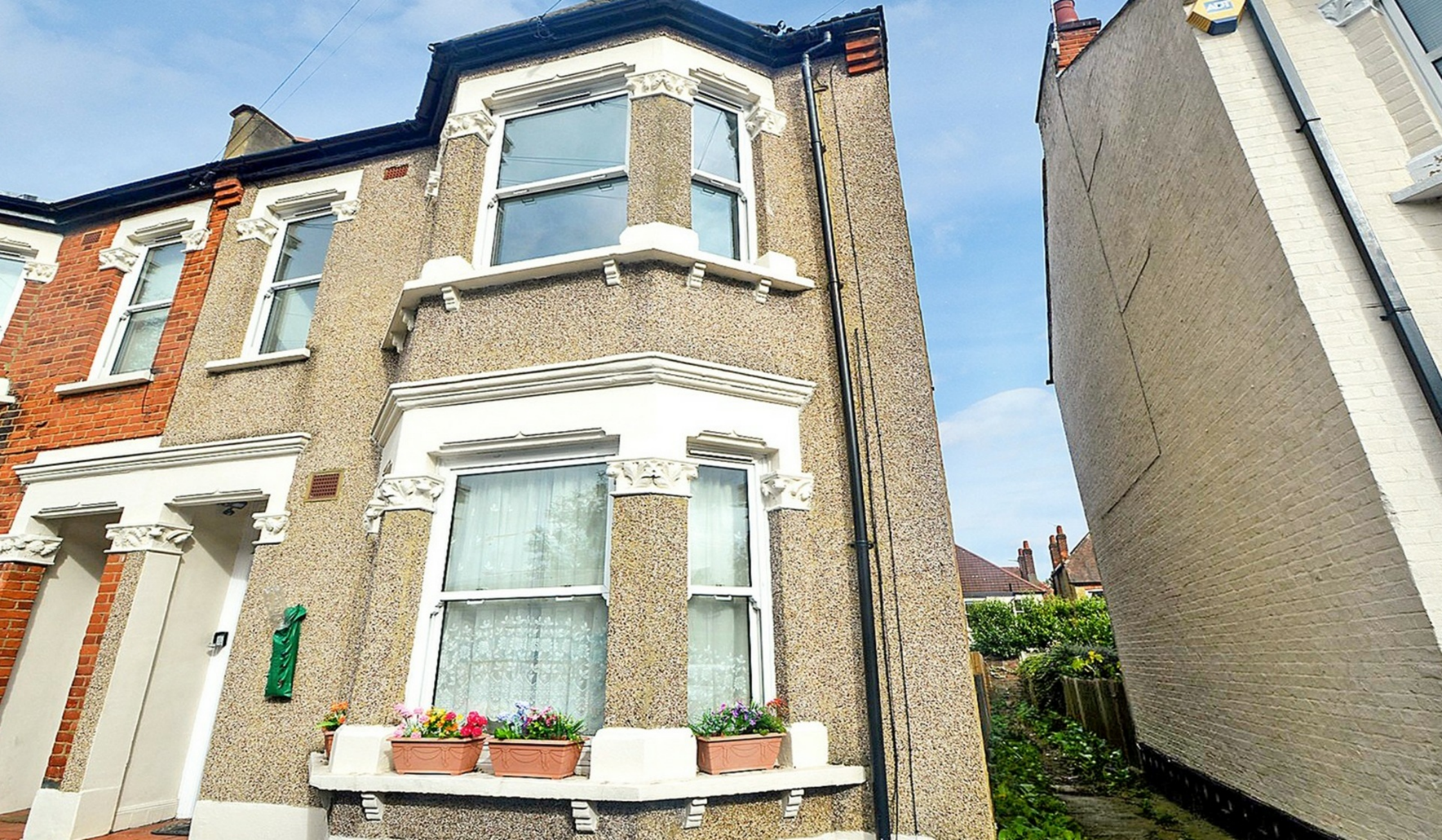
MORGAN ROAD BR1 1 bedroom apartment