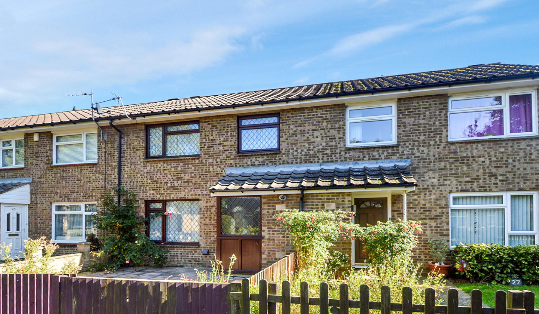
FELDERLAND ROAD ME15 3 bedroom terraced house