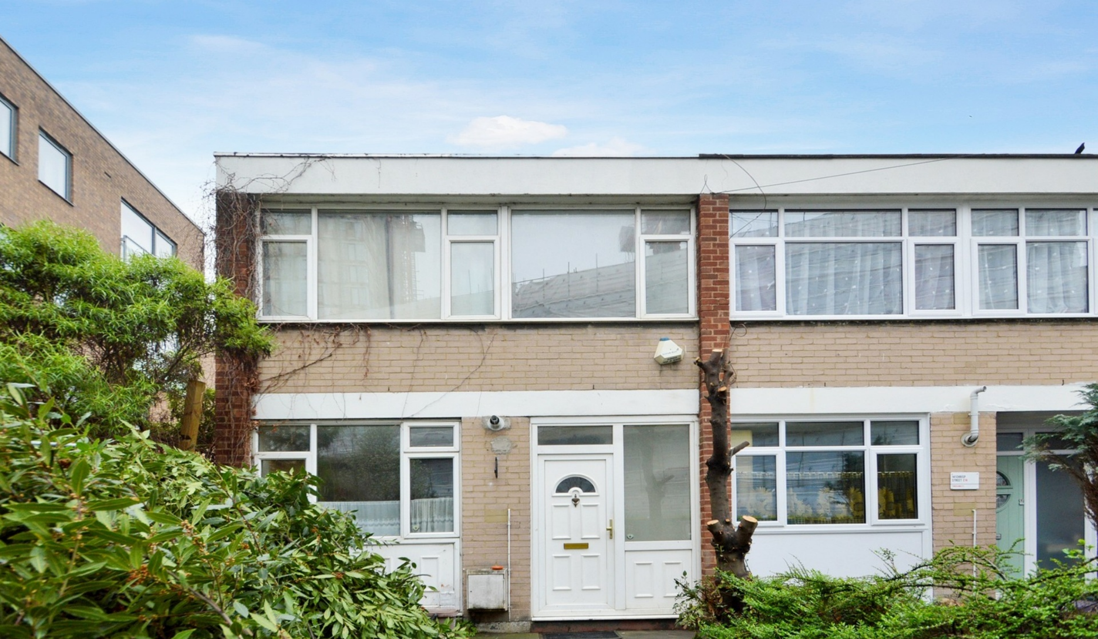
CHRISP STREET E14 3 bedroom terraced house