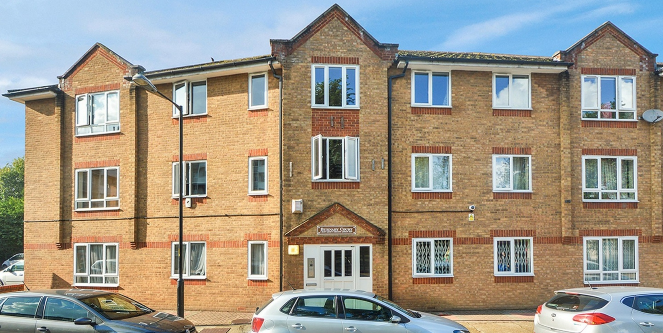
BURNABY COURT SE16 1 bedroom apartment