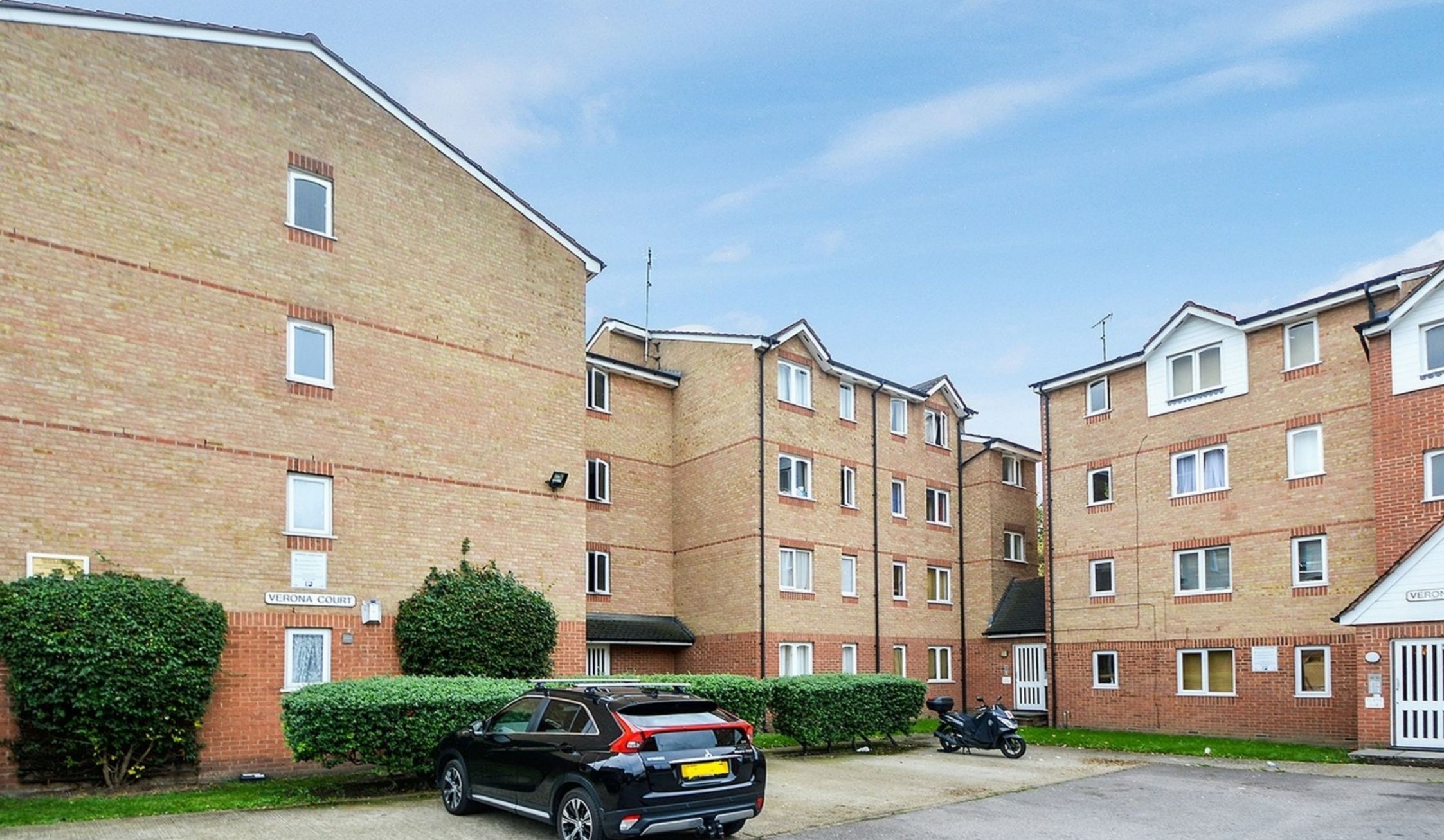
VERONA COURT SE14 1 bedroom apartment