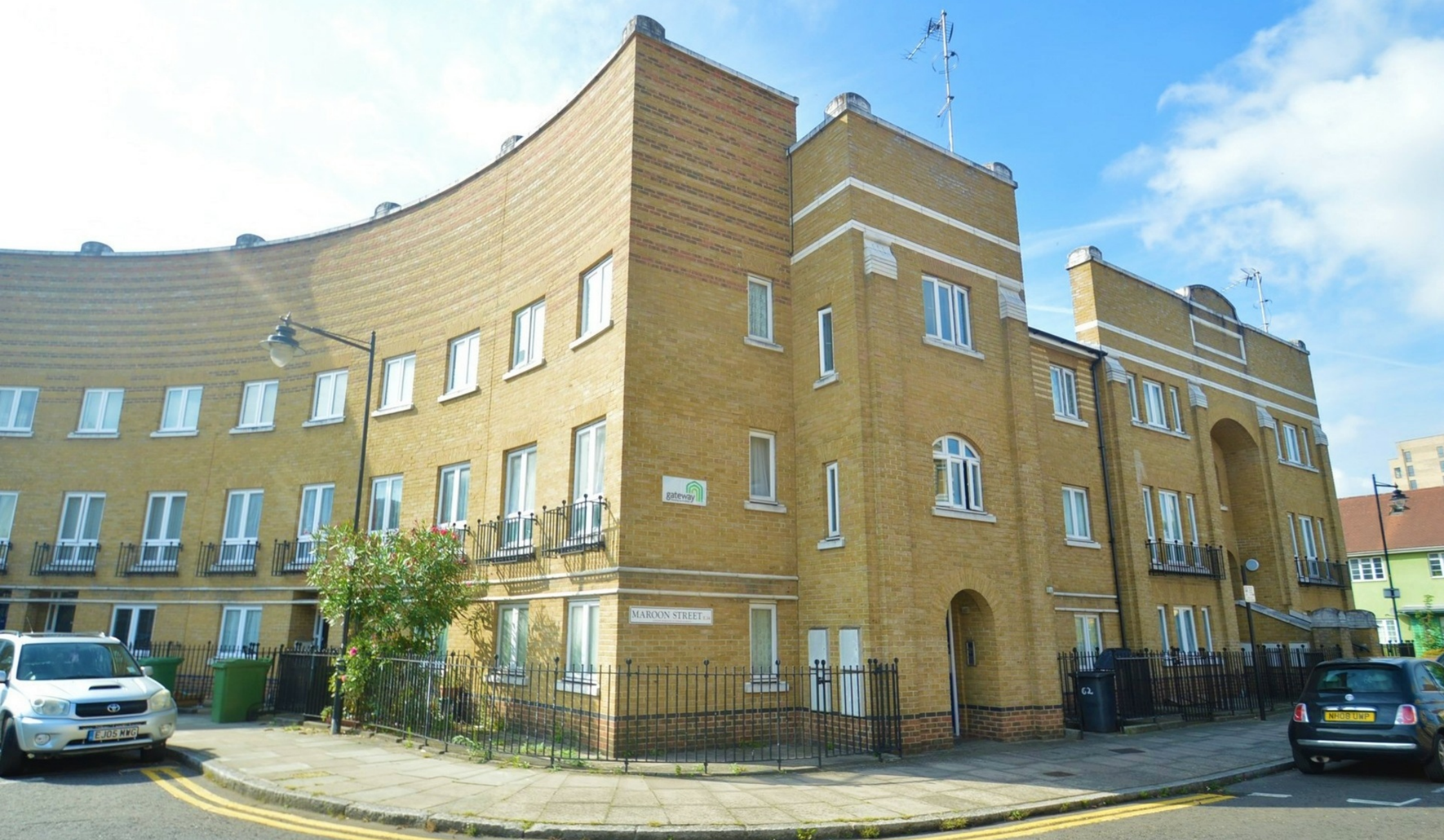
MAROON STREET E14 2 bedroom apartment