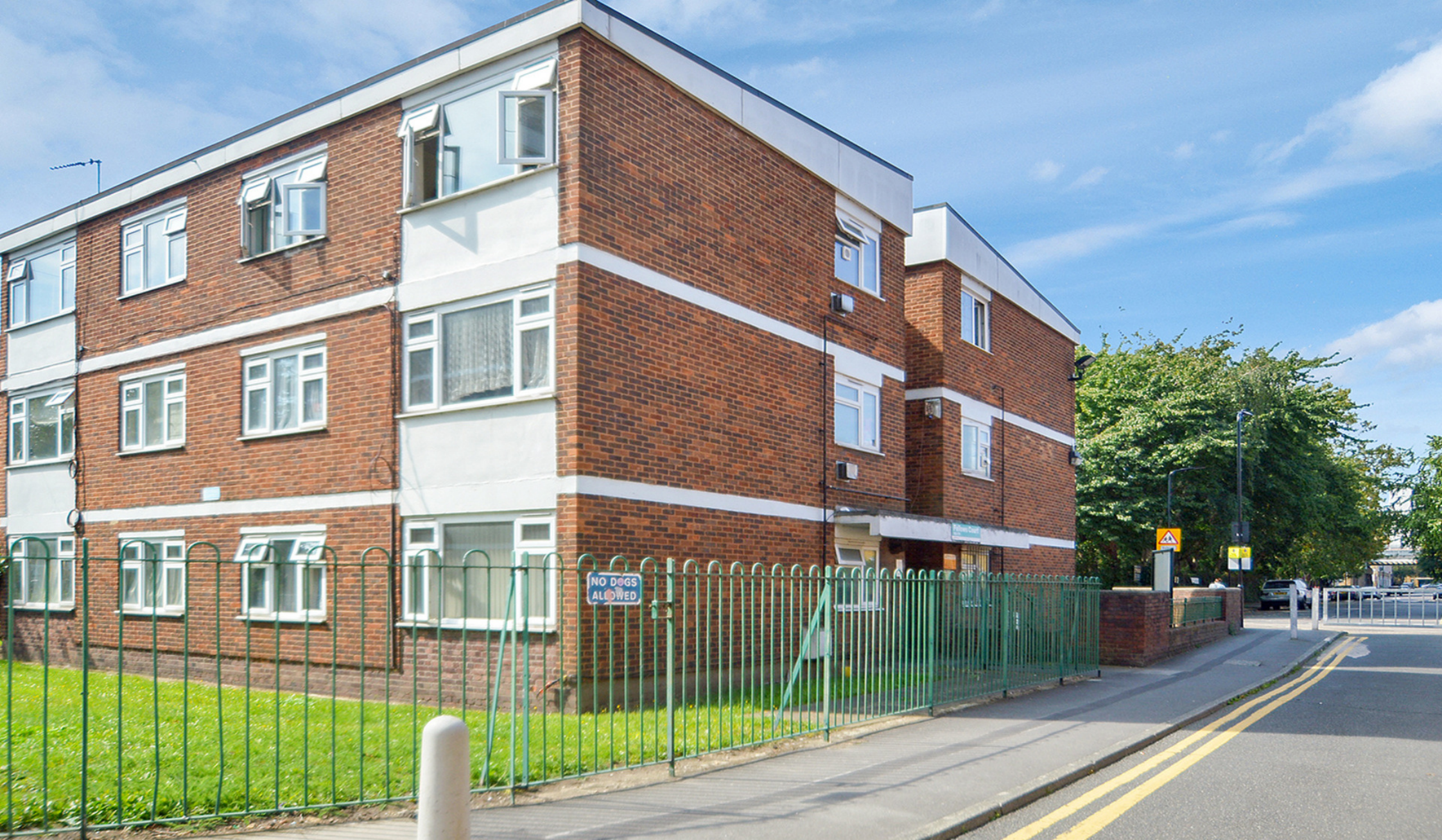
FELLOWS COURT E2 1 bedroom apartment