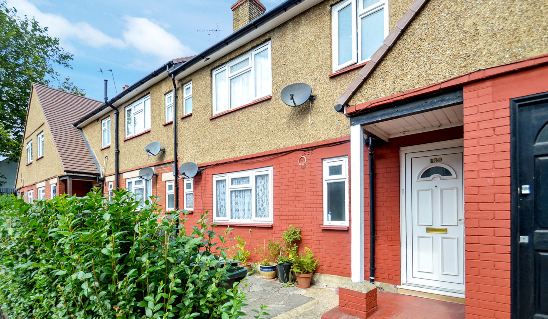
FLANDERS ROAD E6 3 bedroom apartment