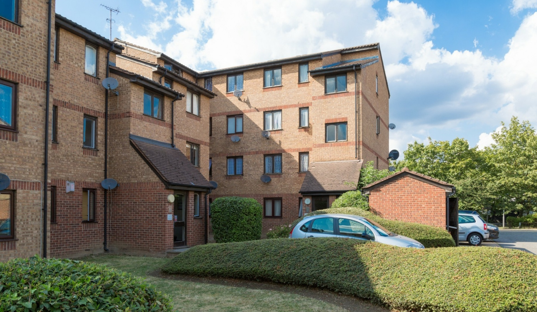
BRIDGE MEADOWS SE14 1 bedroom apartment