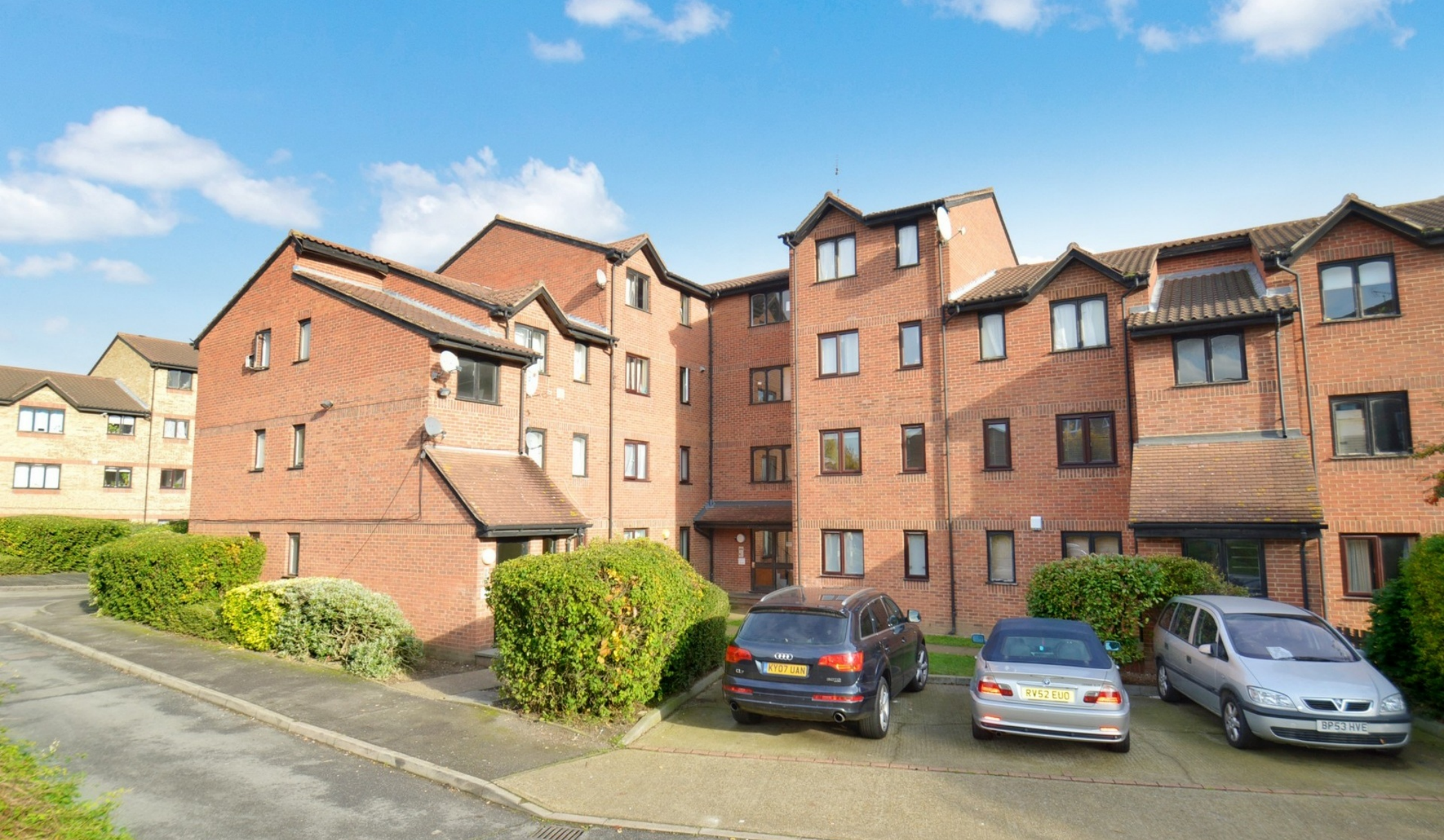
BURBAGE HOUSE SE14 1 bedroom apartment