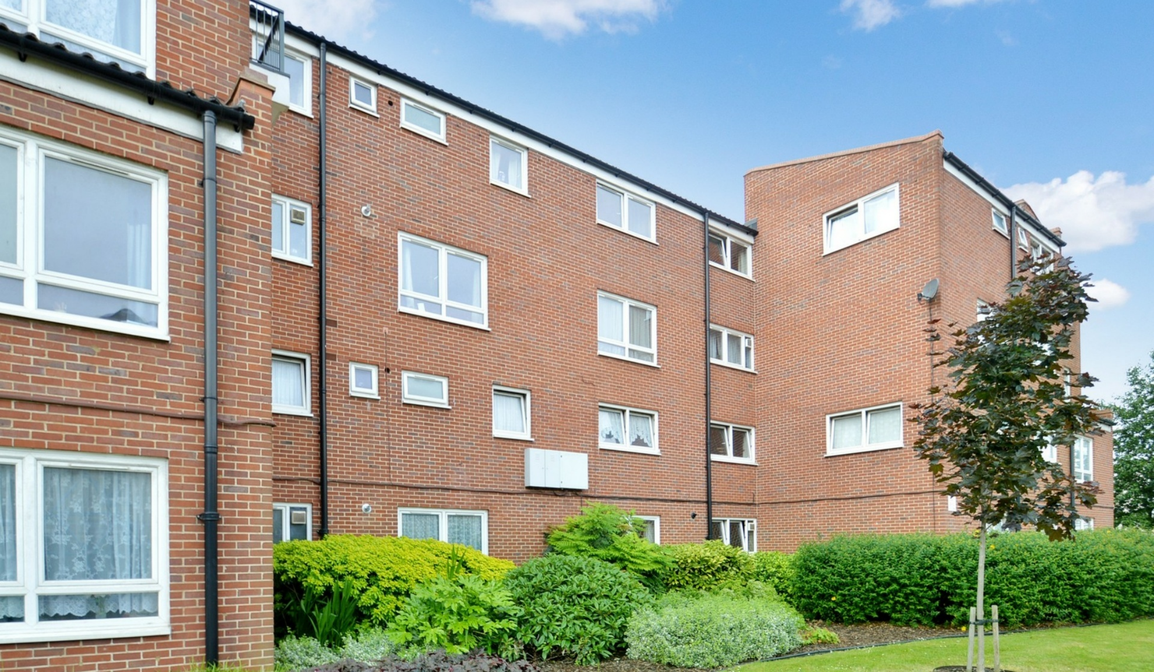
OBAN STREET E14 3 bedroom duplex apartment