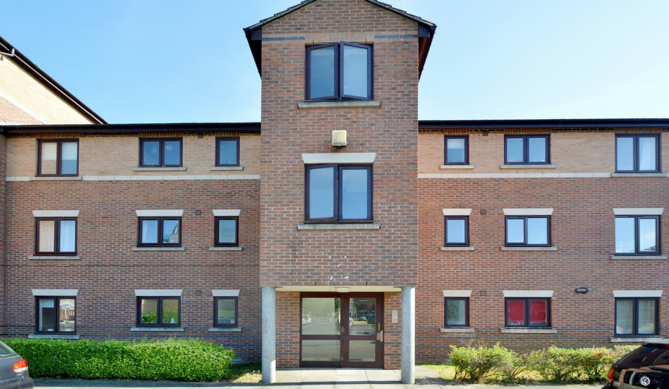
RAVENSBOURNE MANSIONS SE8 2 bedroom apartment