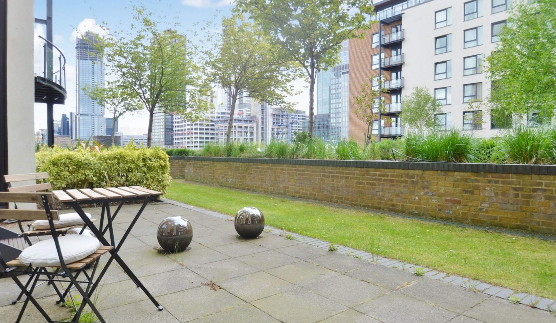
BOARDWALK PLACE E14 1 bedroom apartment