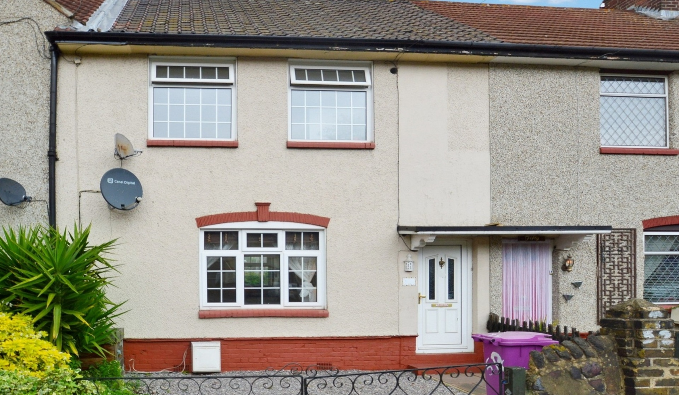
HESPERUS CRESCENT E14 3 bedroom terraced house