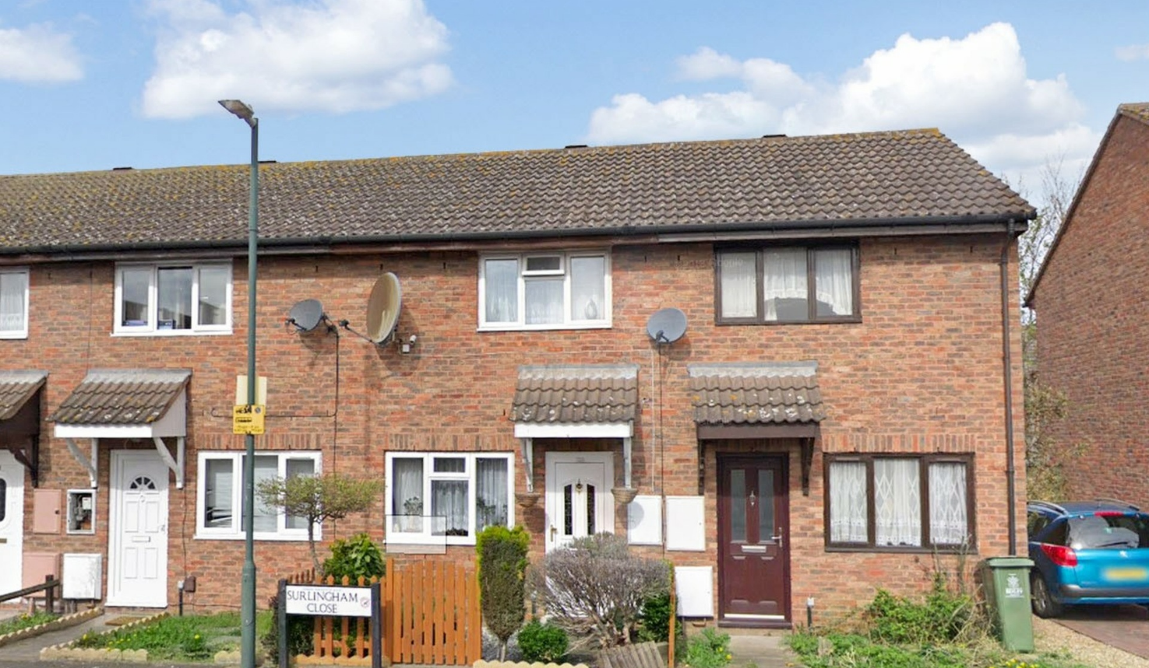
SURLINGHAM CLOSE SE28 2 bedroom terraced house