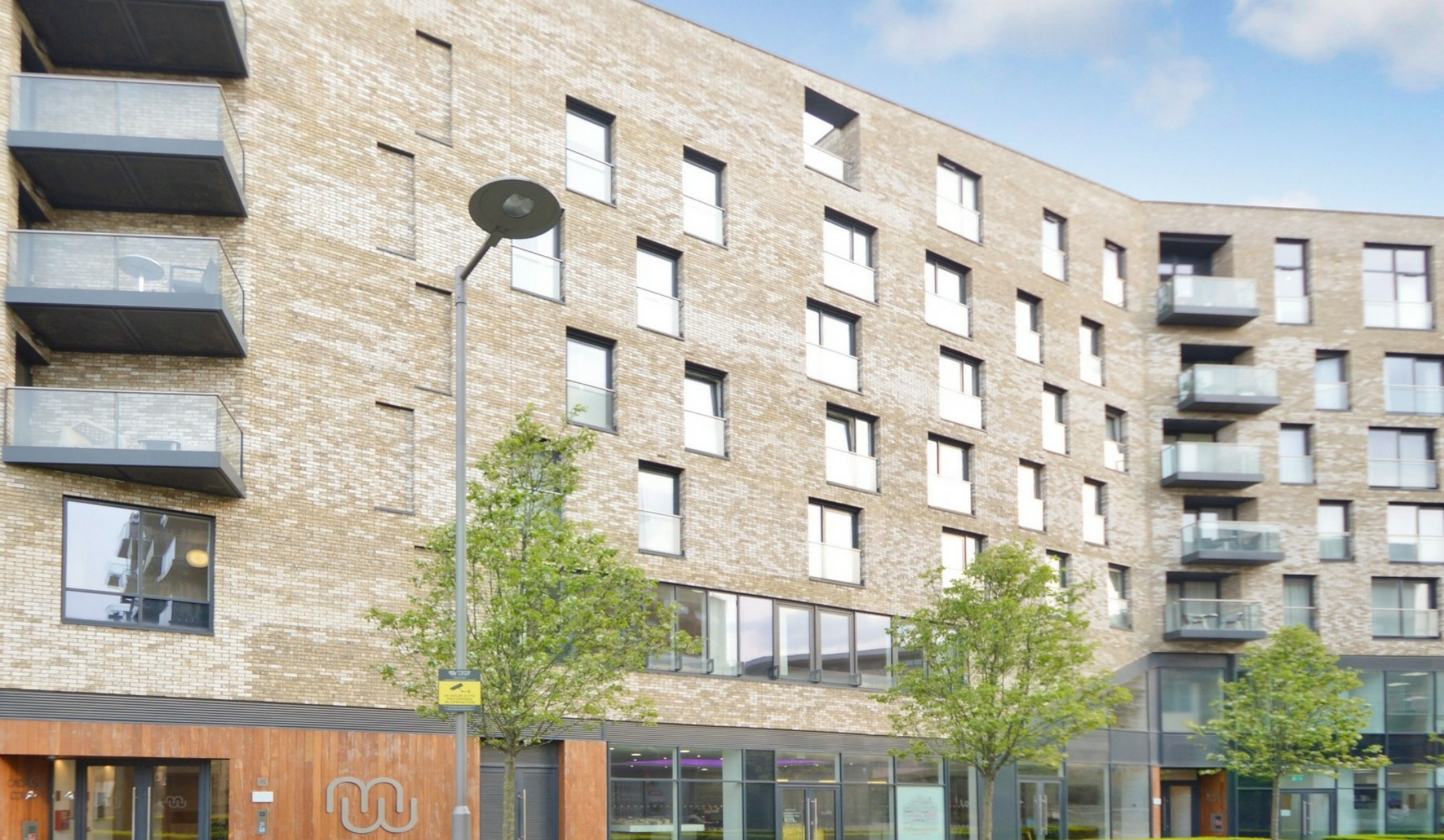
CADMUS COURT SE16 3 bedroom apartment