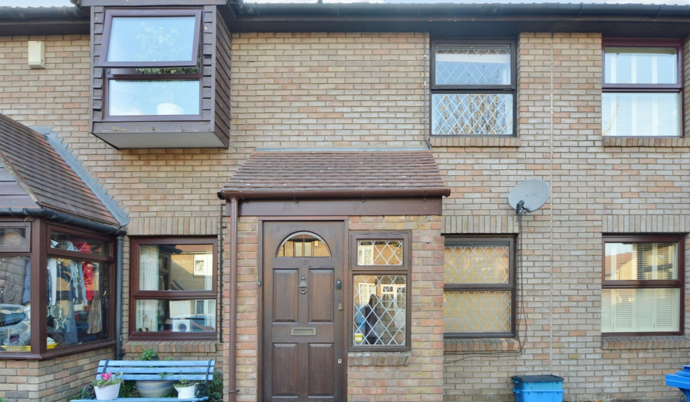
STRATHNAIRN STREET SE1 2 bedroom terraced house