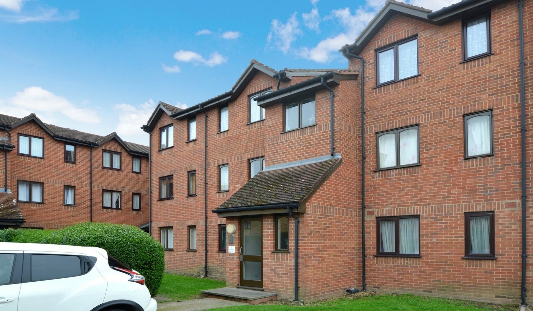
GRAHAM COURT SE14 1 bedroom apartment